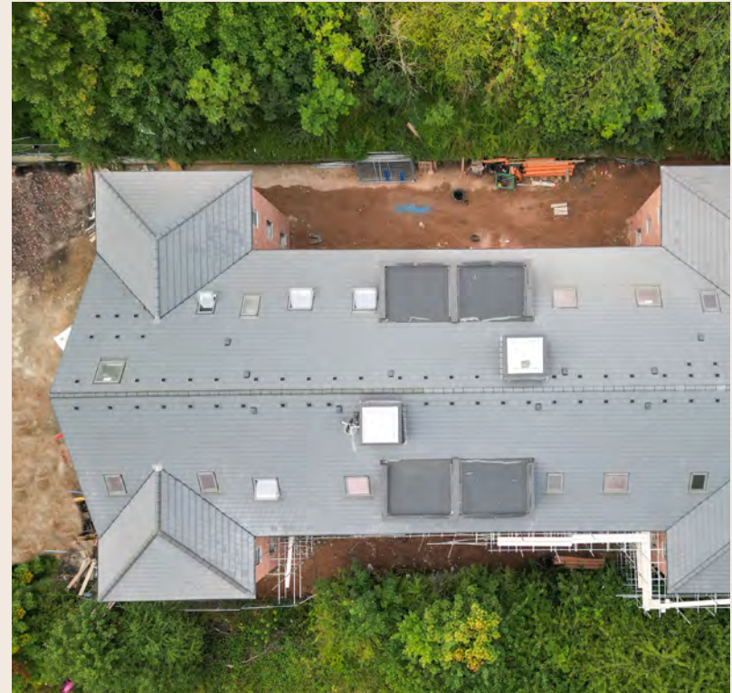
Hallwood Park, Aerial View