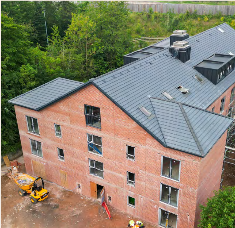
Front View of Hallwood Park, Eagles Way