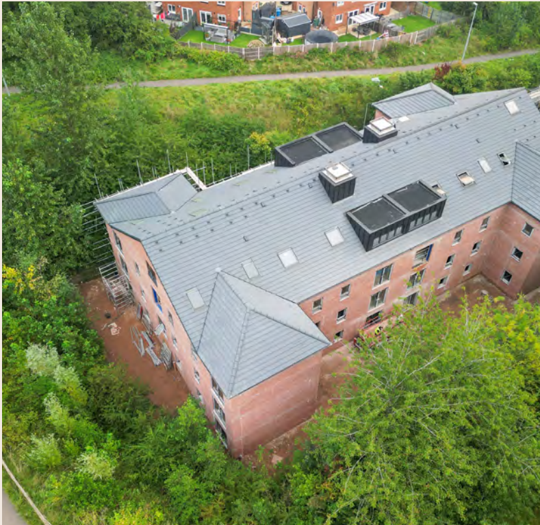
Hallwood Park, Weston Link View