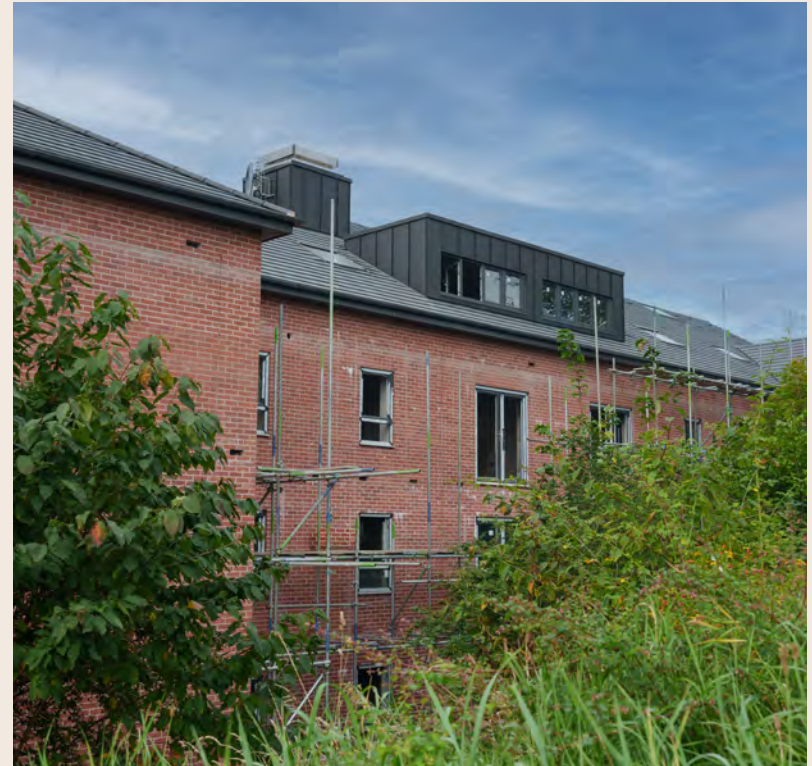
Hallwood Park, Tawny Court View