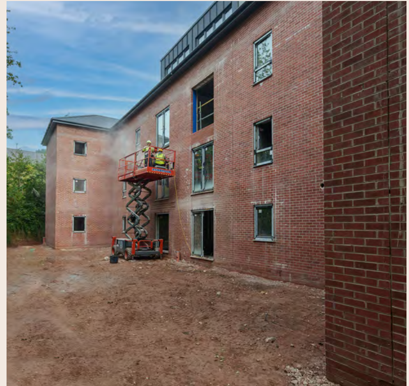
Rear Garden View