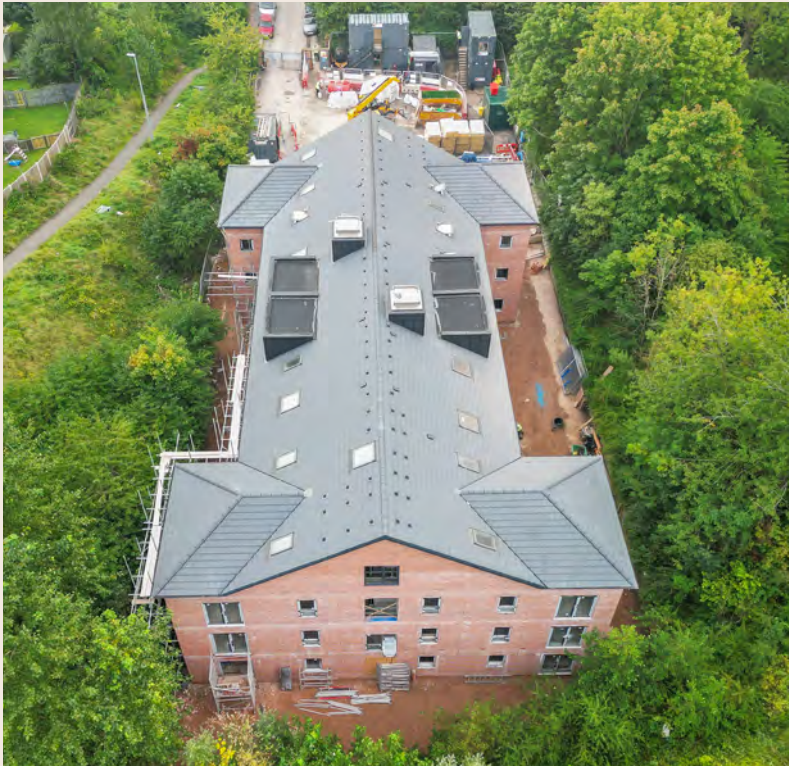
Hallwood Park Weston Link View