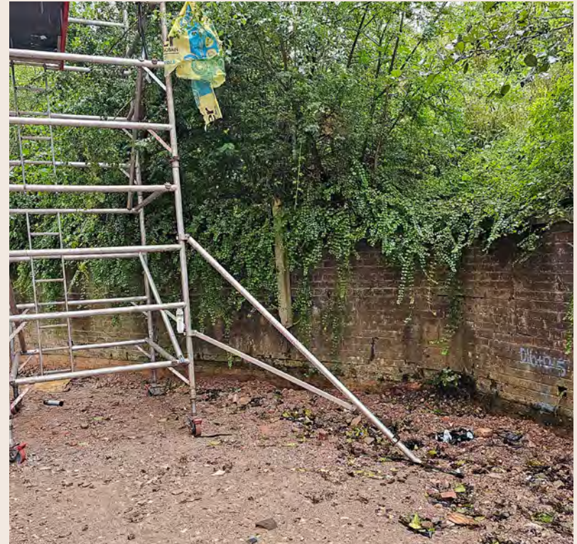
Garden Right Side