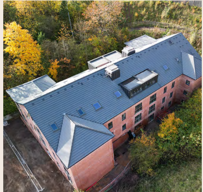
Hallwood Park, Right Side View