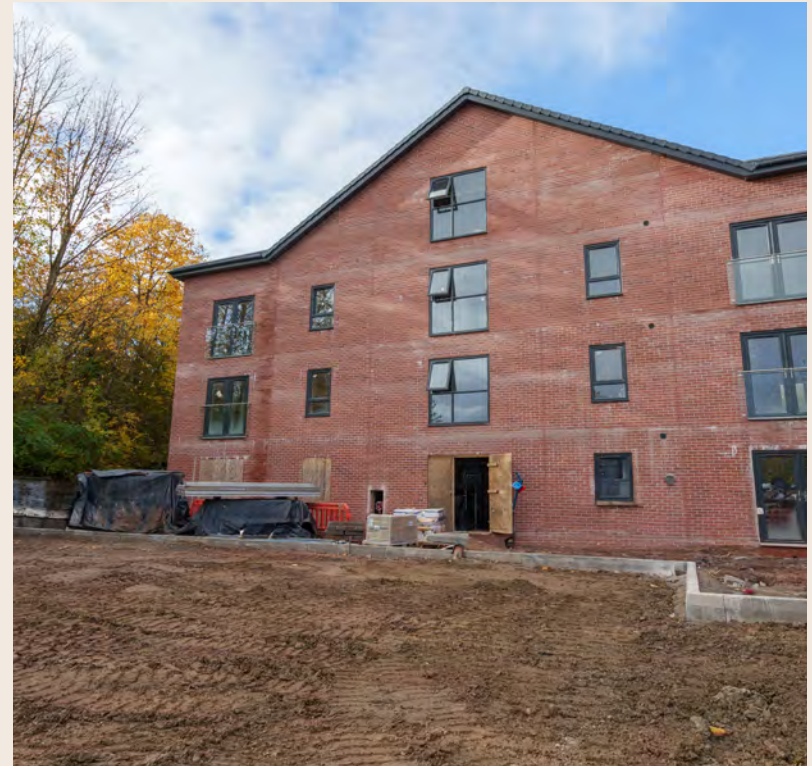
Front View of Hallwood Park, Eagles Way