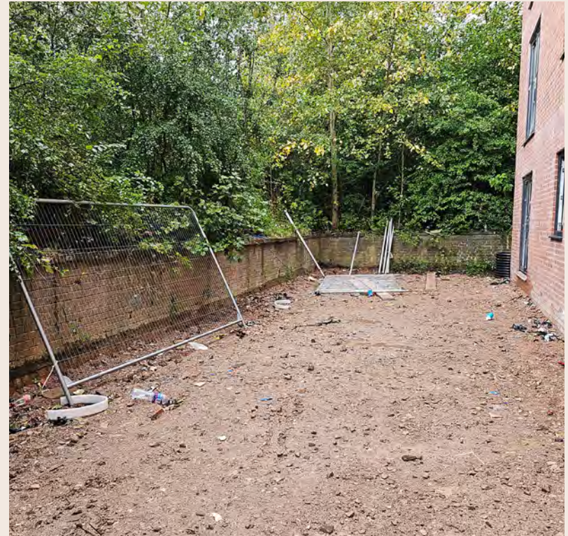
Garden Rear View