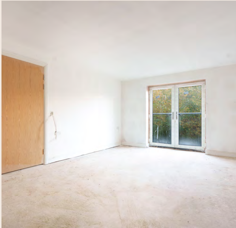
Kitchen/Living Area Progression