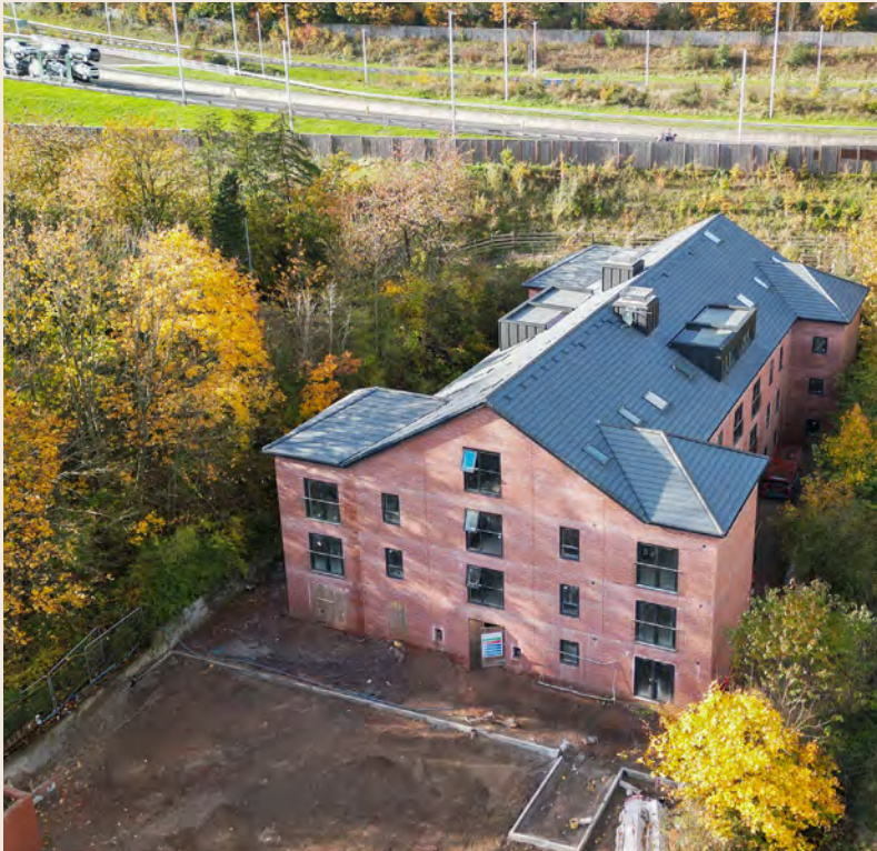
Front View of Hallwood Park, Eagles Way