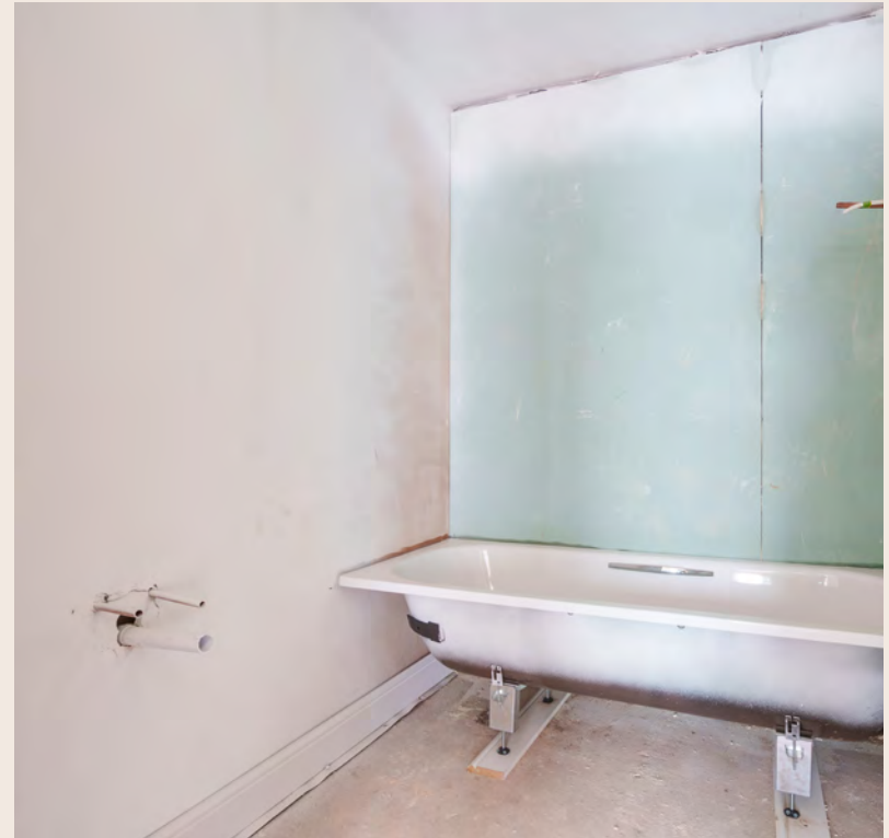
Bathroom Internal Fit-Out