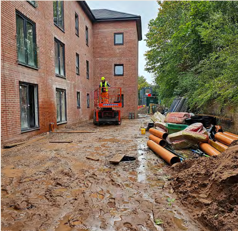
Garden, Left Side