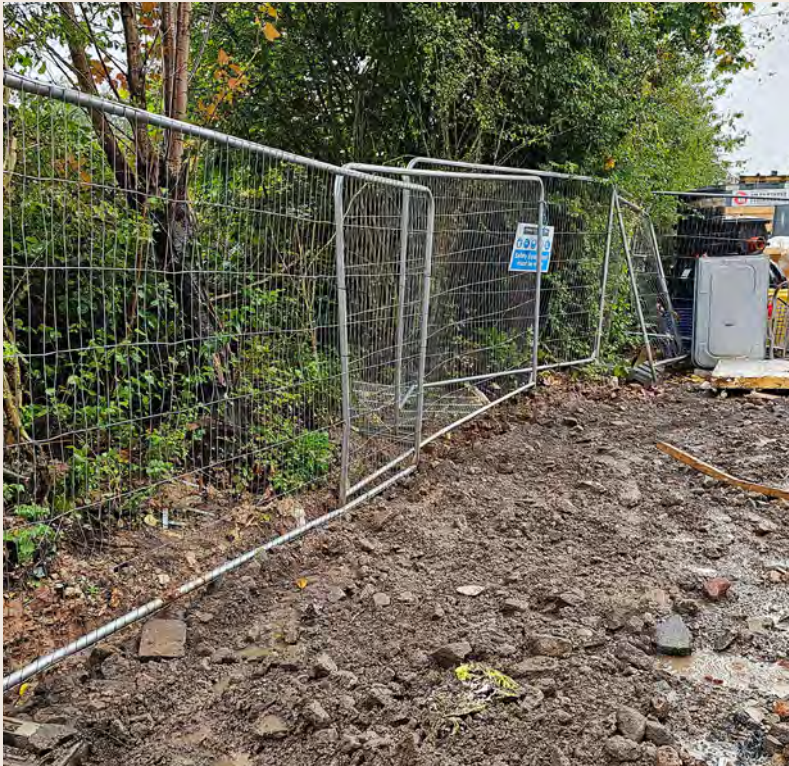
Garden Right Side