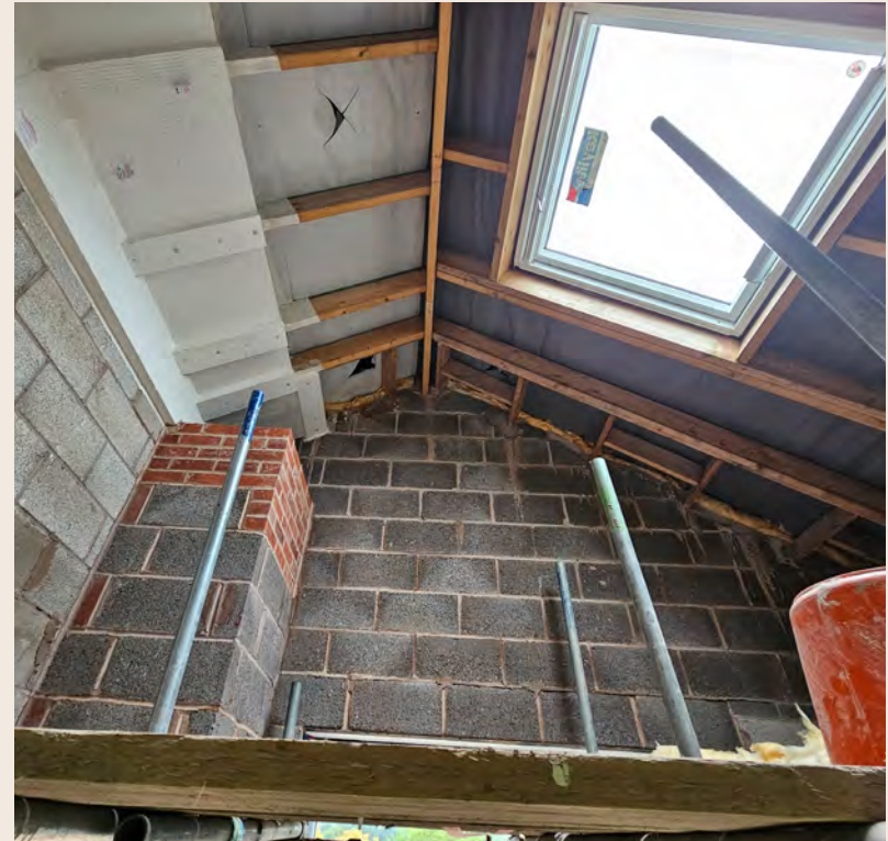
Skylight Ceiling and Roof Construction