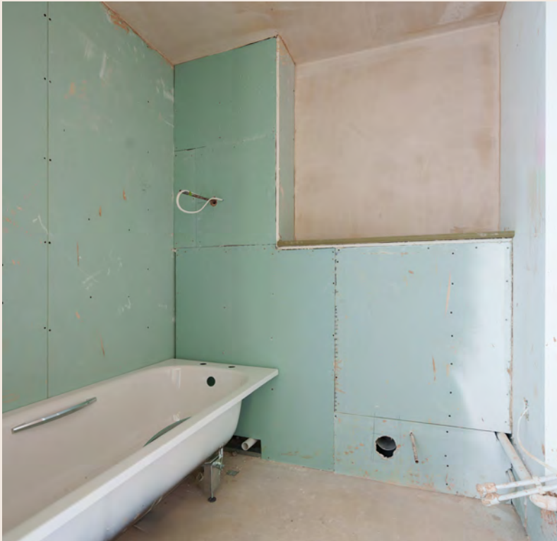
Bathroom Internal Fit-Out