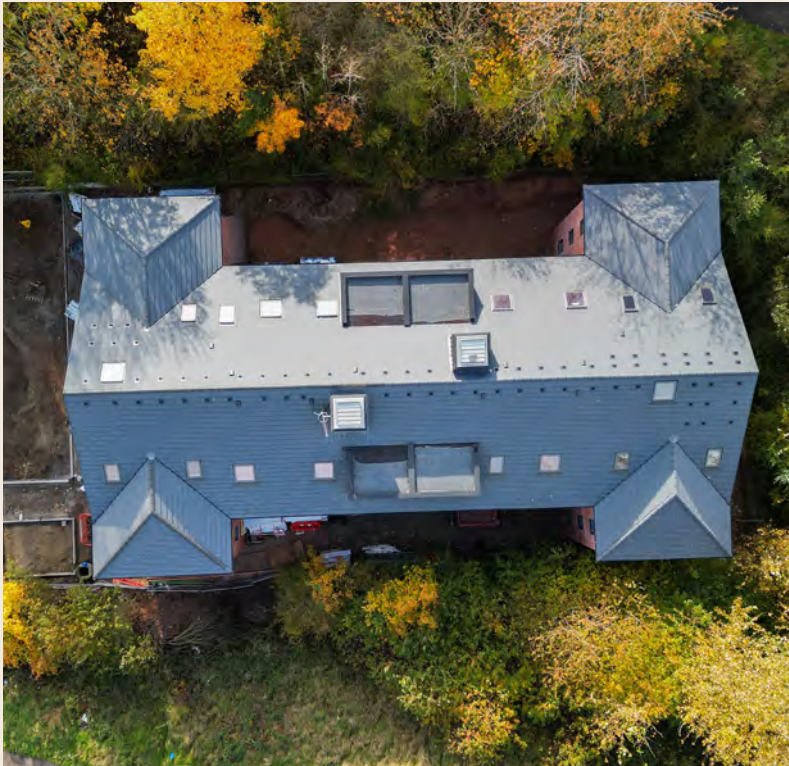
Hallwood Park Aerial View