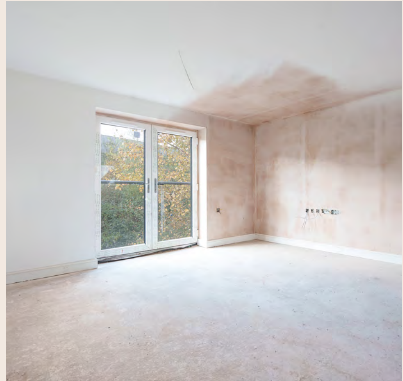
Kitchen/Living Area Progression