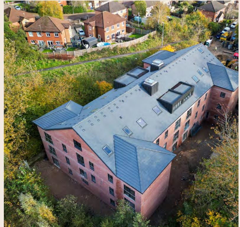
Hallwood Park, Weston Link View