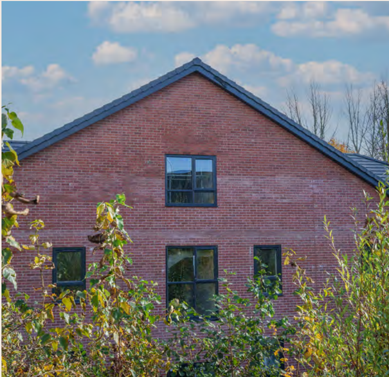
Hallwood Park, Rear View