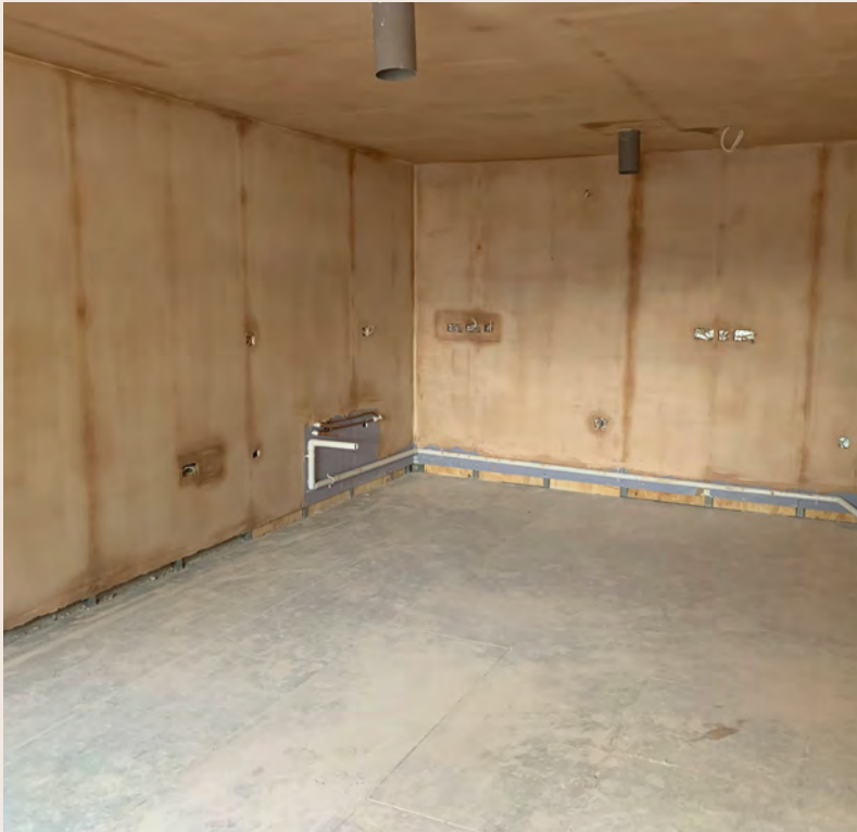
Internal Room Progression