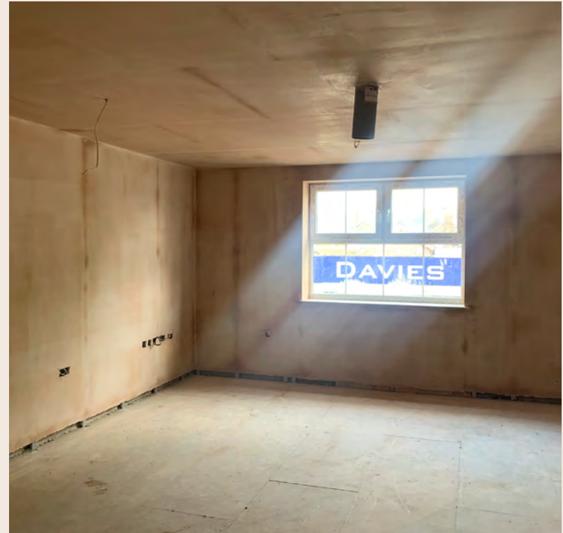
Internal Room Progression