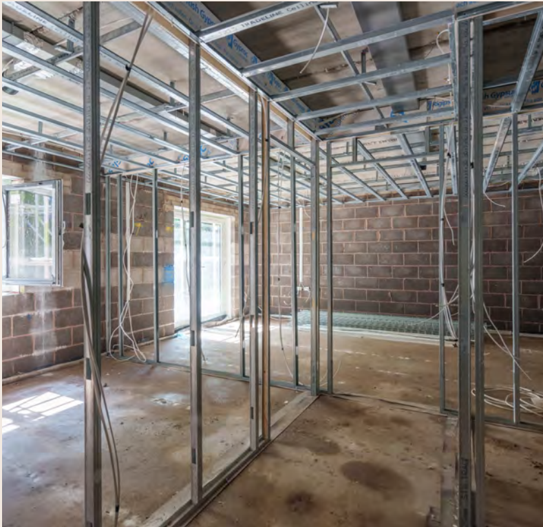
Internal Room Framework