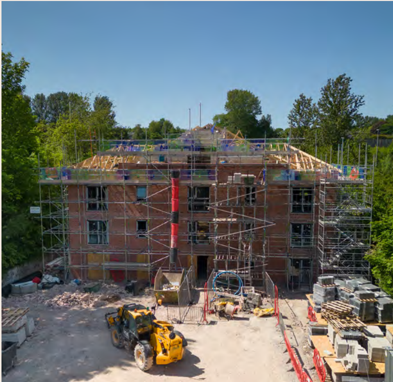
Front View of Hallwood Park, Eagles Way