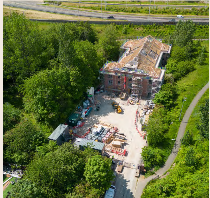
Front View of Hallwood Park, Eagles Way