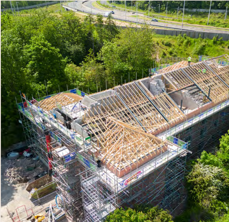
Front View of Hallwood Park, Eagles Way