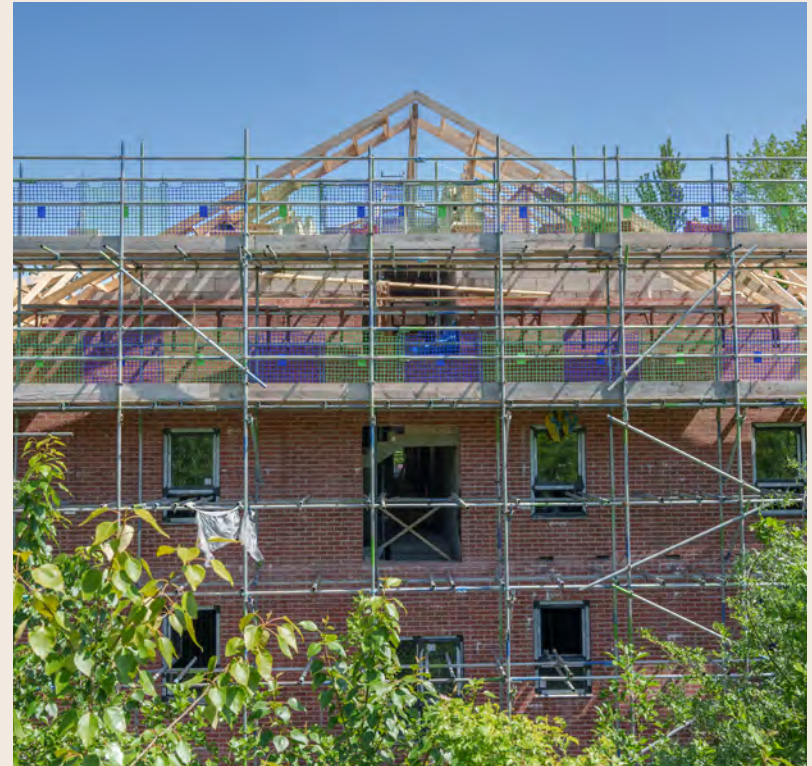
Rear Garden View