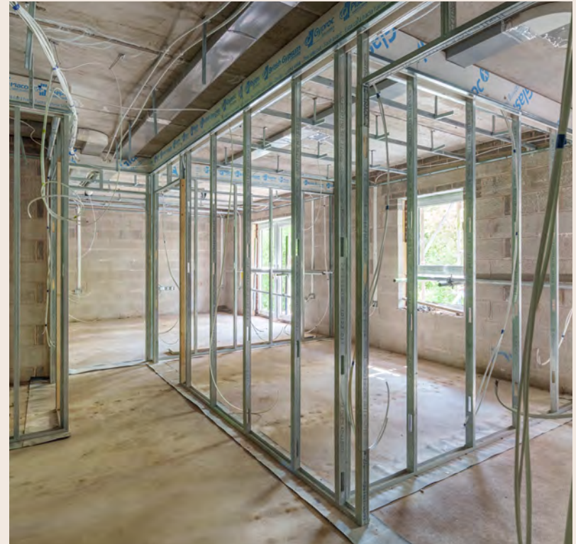
Internal Room Framework