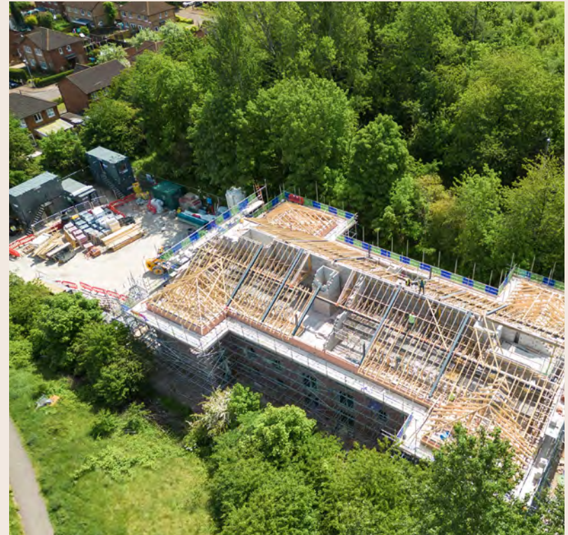
Hallwood Park, Weston Link View