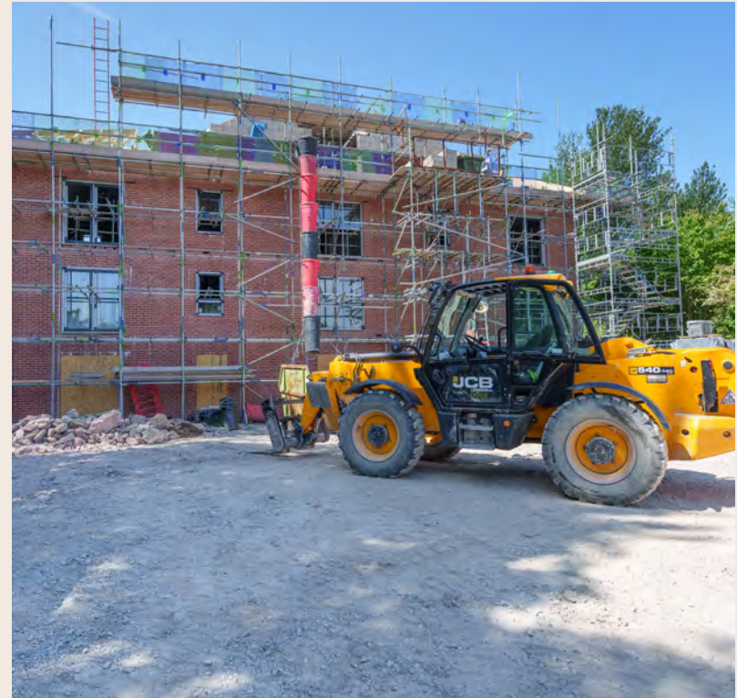
Front View of Hallwood Park, Eagles Way