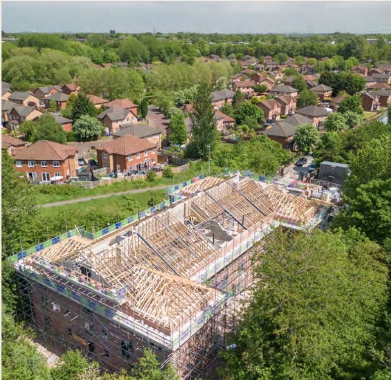
Hallwood Park Weston Link View