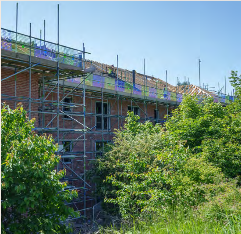
Right Side Garden View