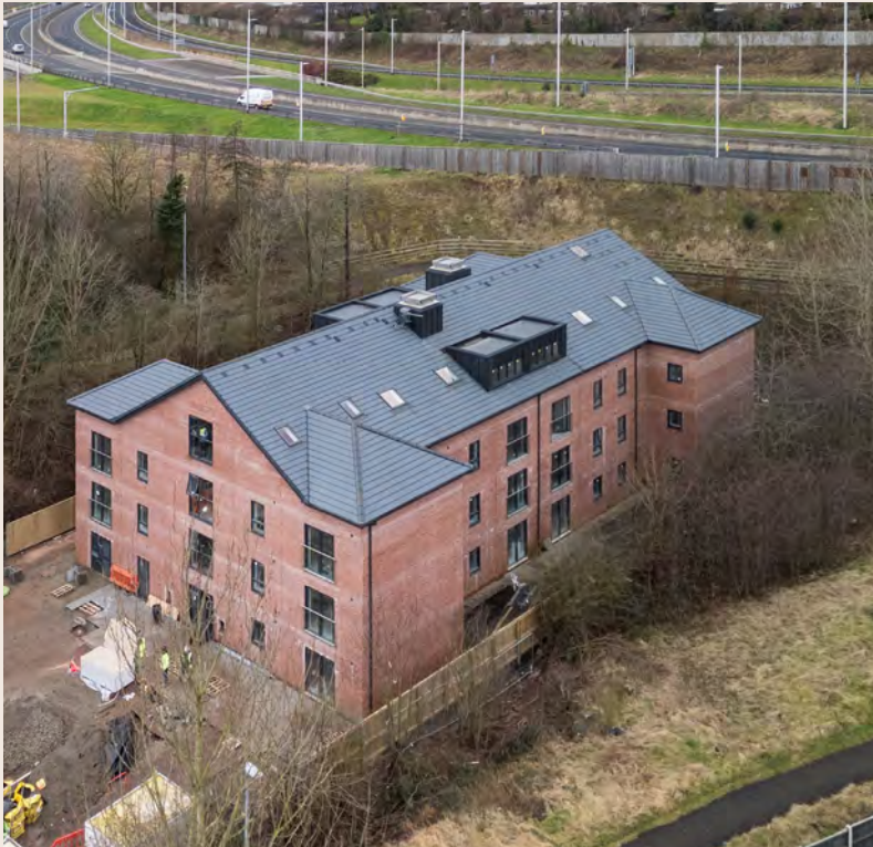
Aerial View, Eagles Way