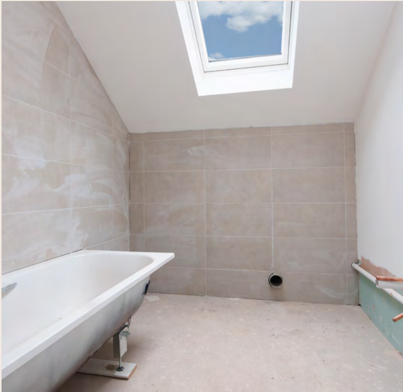
Bathroom Internal Progress