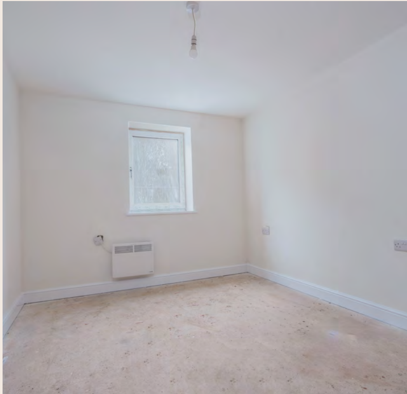
Bedroom Internal Fit-Out