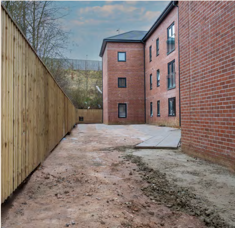
Left Garden Wing, Paving Laid