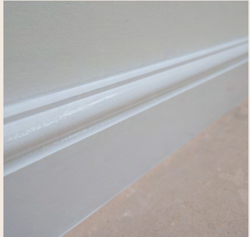
Skirting Boards Laid