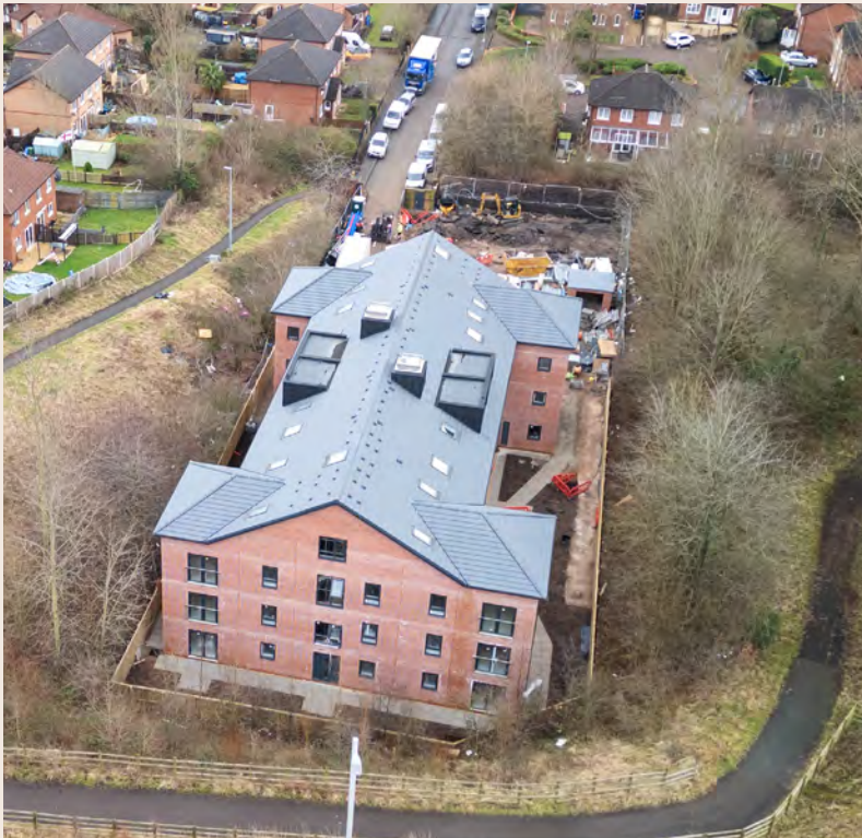
Hallwood Park Aerial View, Weston Link