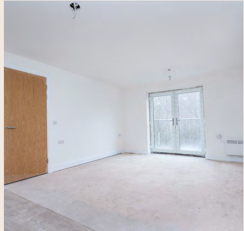
Living Area Internal Fit-Out