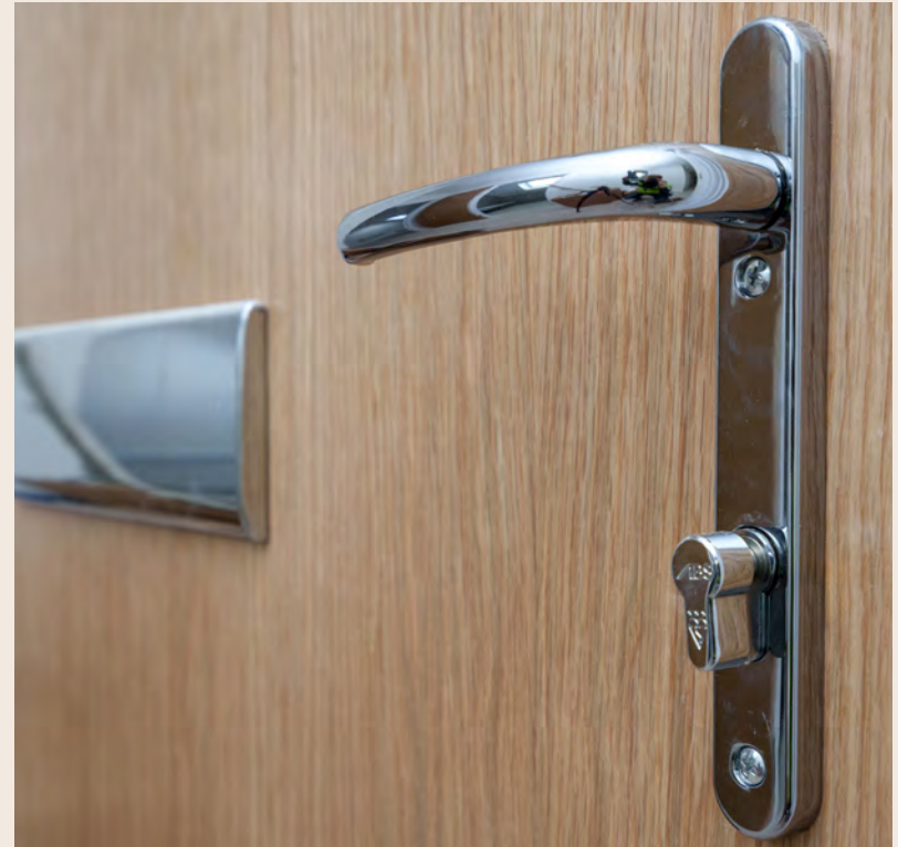
Door Handles on Front Doors