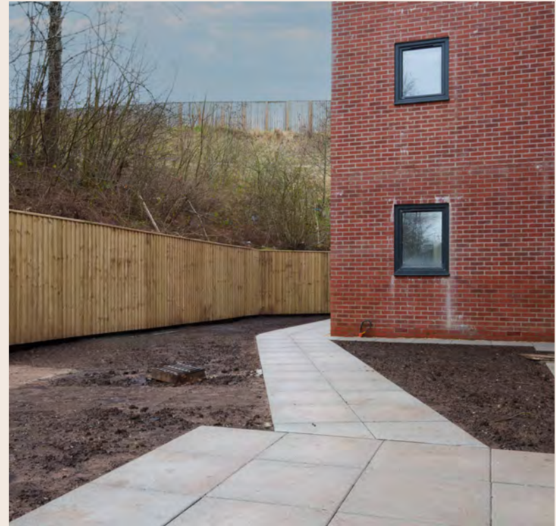
Left Garden Wing, Paving Laid