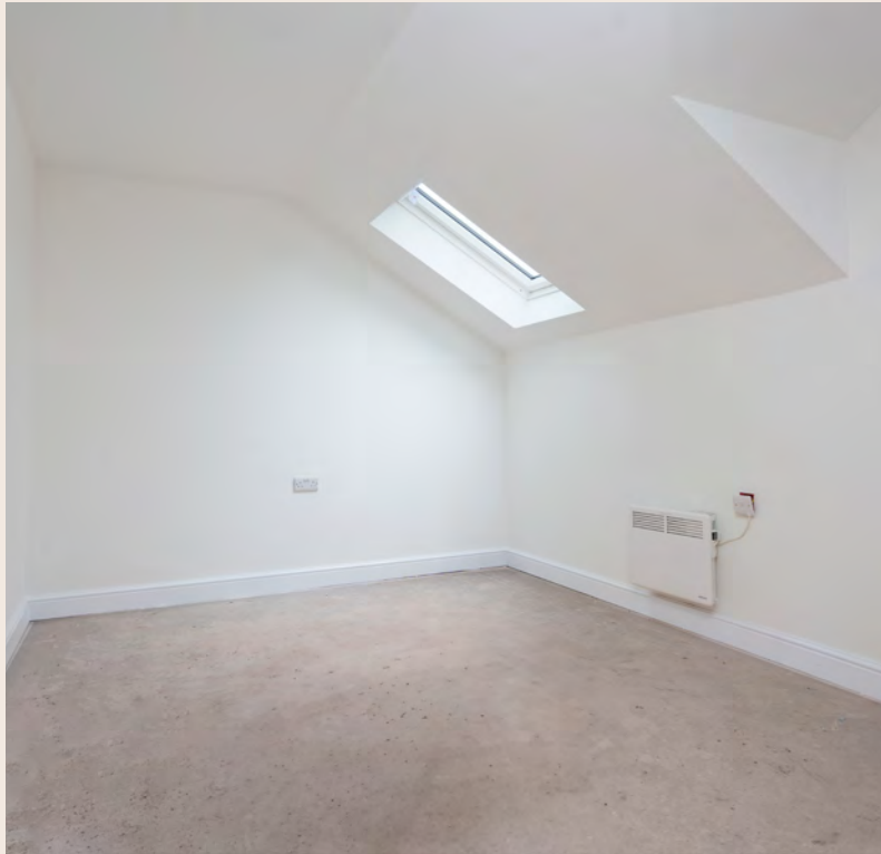
Bedroom Internal Fit-Out