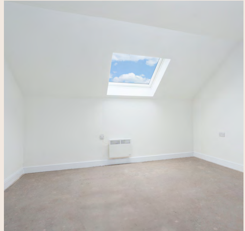
Bedroom Internal Fit-Out