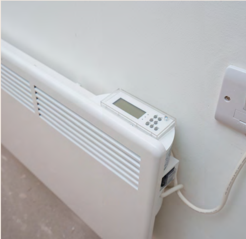
Internally Controlled Heating Points