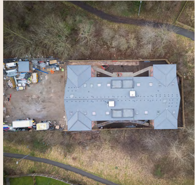
Hallwood Park, Aerial View