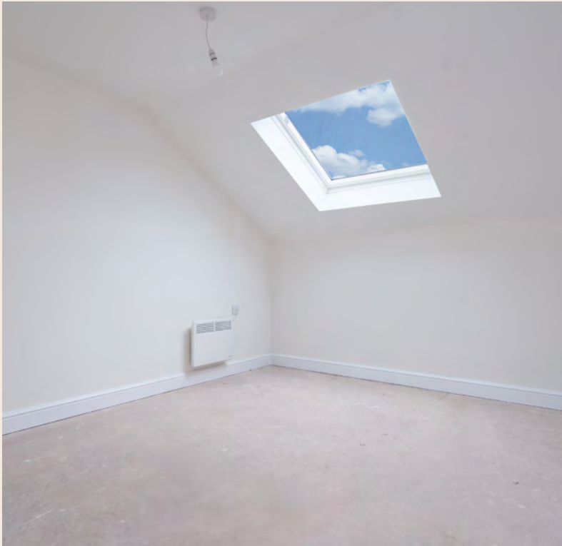
Bedroom Internal Fit-Out