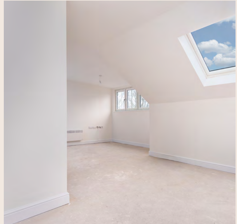
Kitchen/Living Area Internal Progress