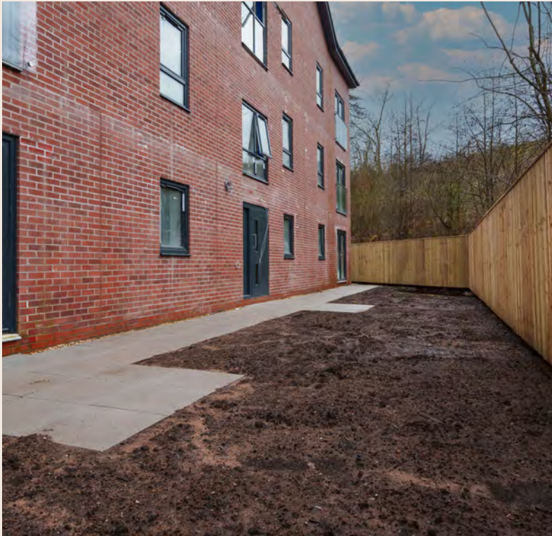
Rear Garden, Paving Laid