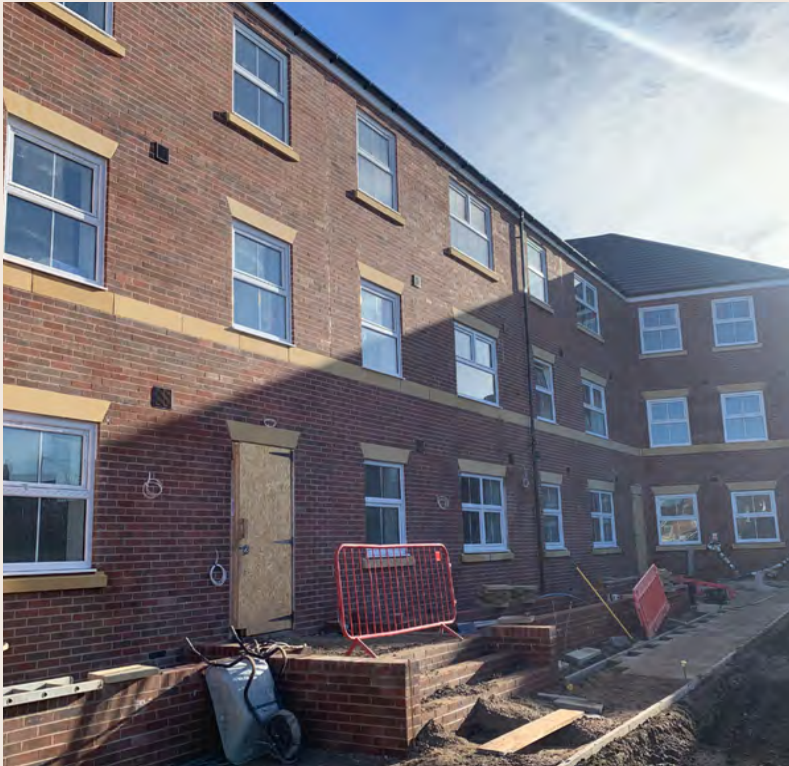
Marsh House, Rear View