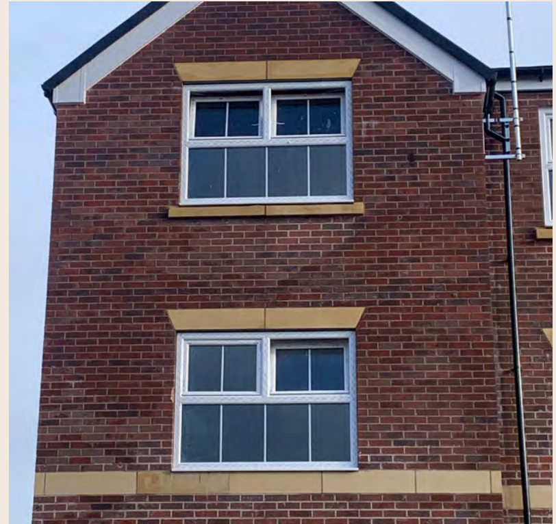
Marsh House, Rear View