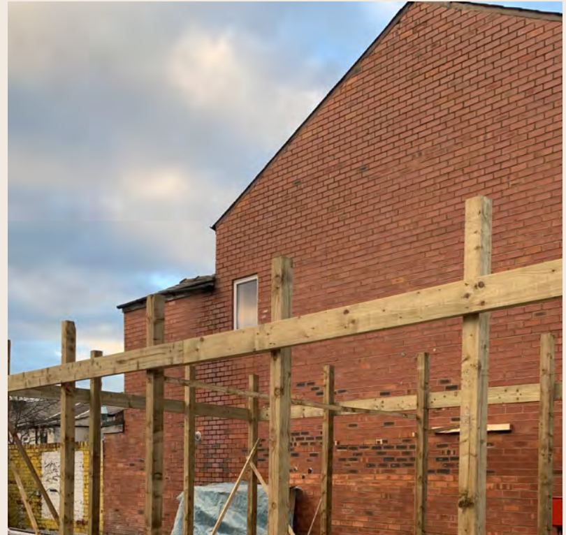
Marsh House, Side View