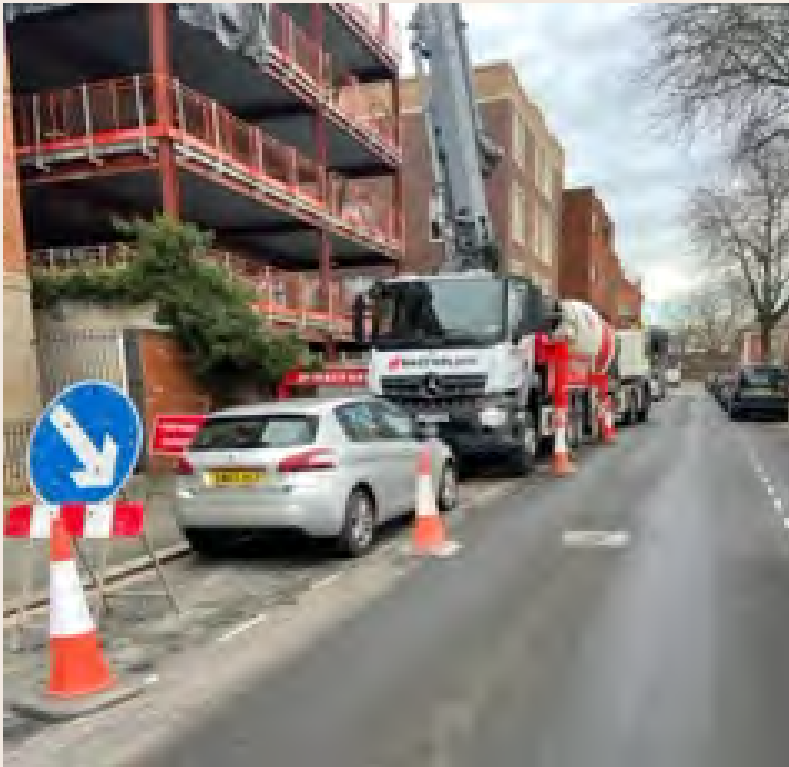
The Vicarage, Palmyra Square North View