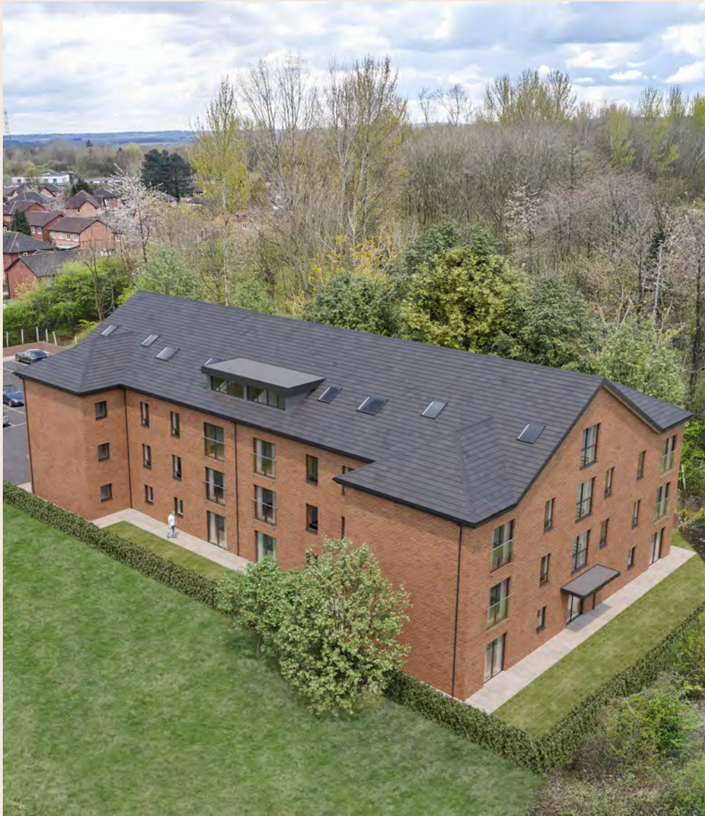
Hallwood Park Aerial, Weston Link View