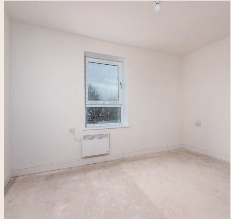
Bedroom Internal Fit-Out