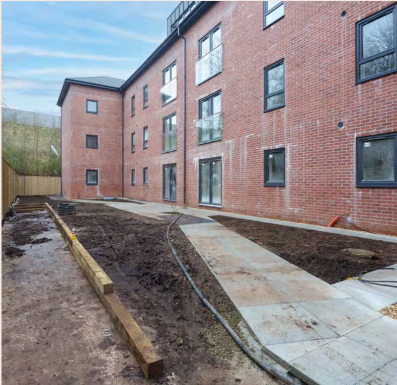
Garden Left Side