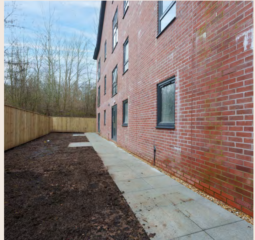
Garden, Rear View