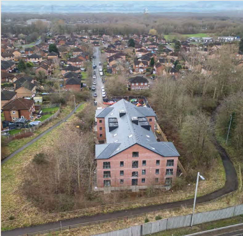
Hallwood Park Aerial View, Weston Link