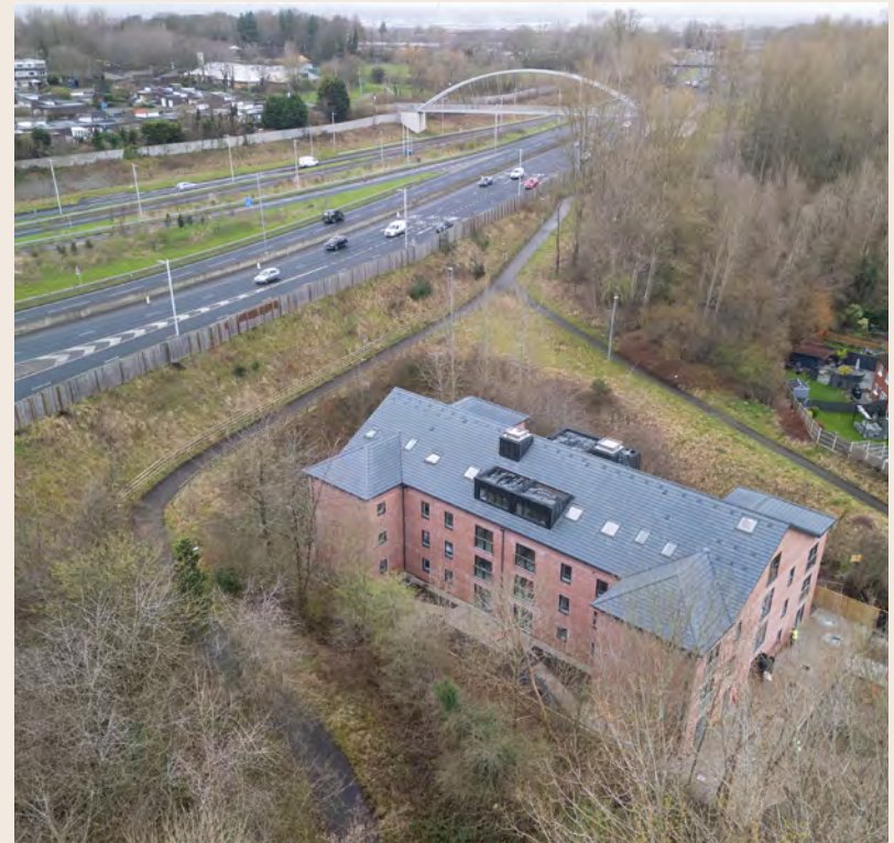
Hallwood Park, Gaunts Way View