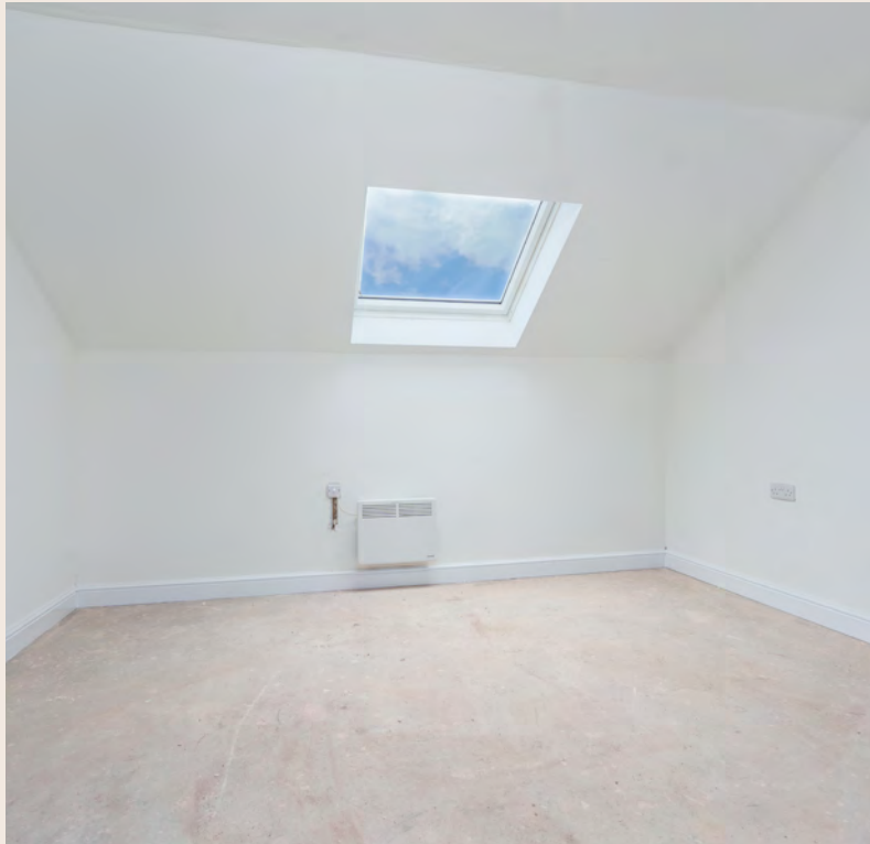
Bedroom Internal Fit-Out