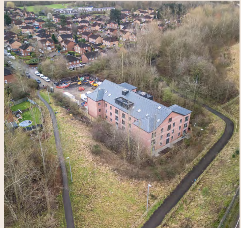
Hallwood Park Aerial View, Weston Link