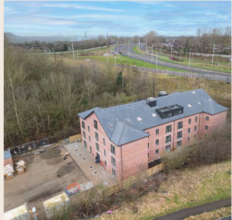
Hallwood Park, Earls Way View