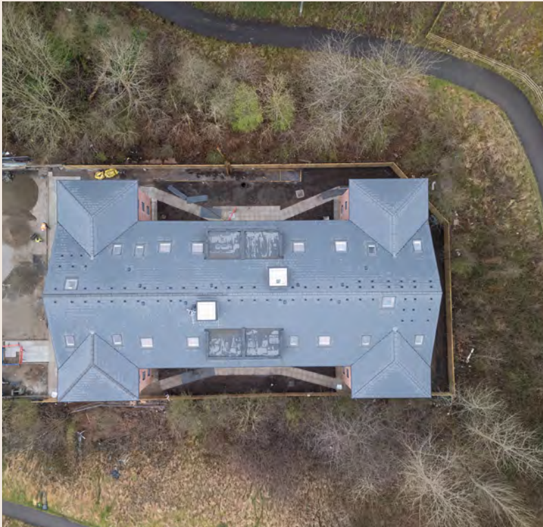
Hallwood Park, Aerial View