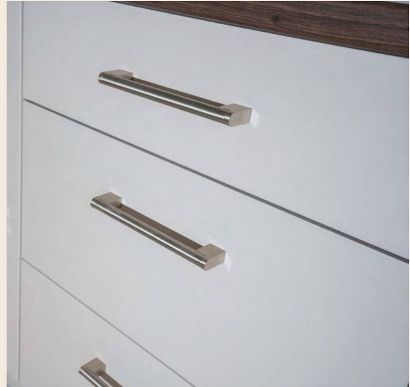
Kitchen Unit Installation