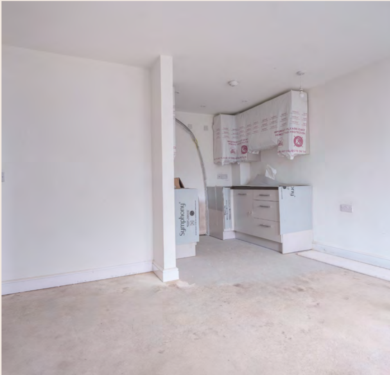
Kitchen Unit Installation