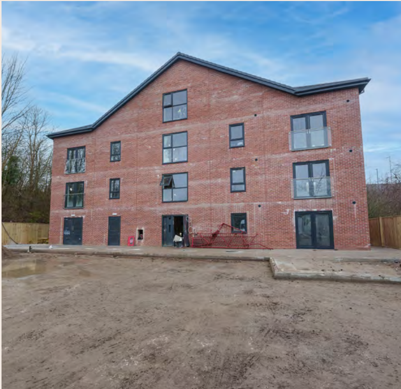
Front View of Hallwood Park