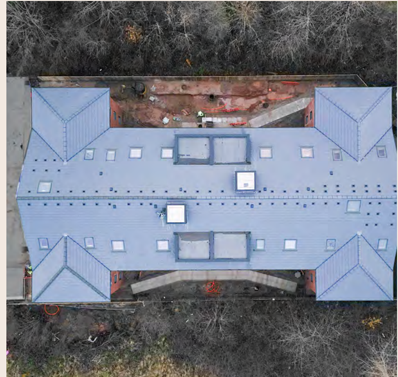
Hallwood Park, Aerial View