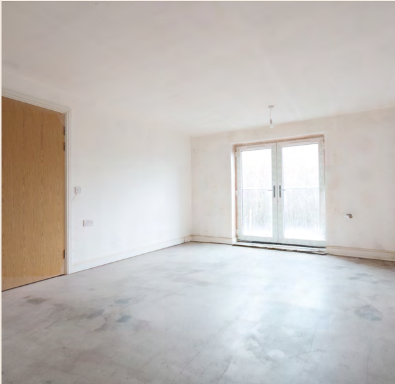
First Coat Underway in Kitchen/Living Areas of Lower Floors