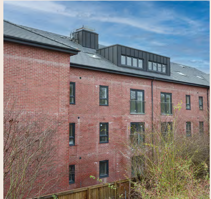
Hallwood Park, Right Side View