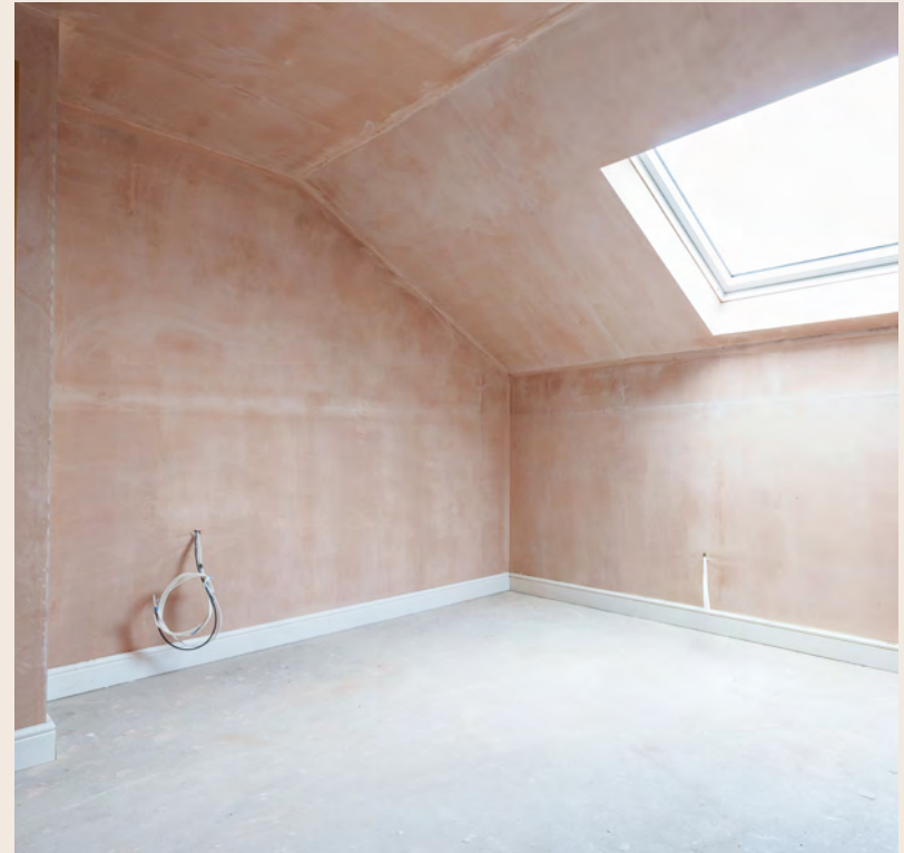
Plastering Commencement in Bedrooms on Upper Floors