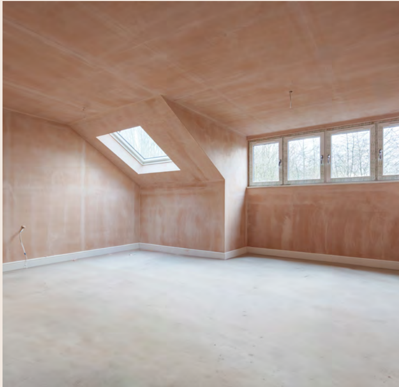
Plastering Commencement in Kitchen/Living Areas on Upper Floors