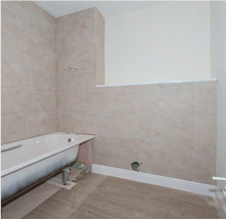
Bathroom Flooring and Tiling Underway on Lower Levels