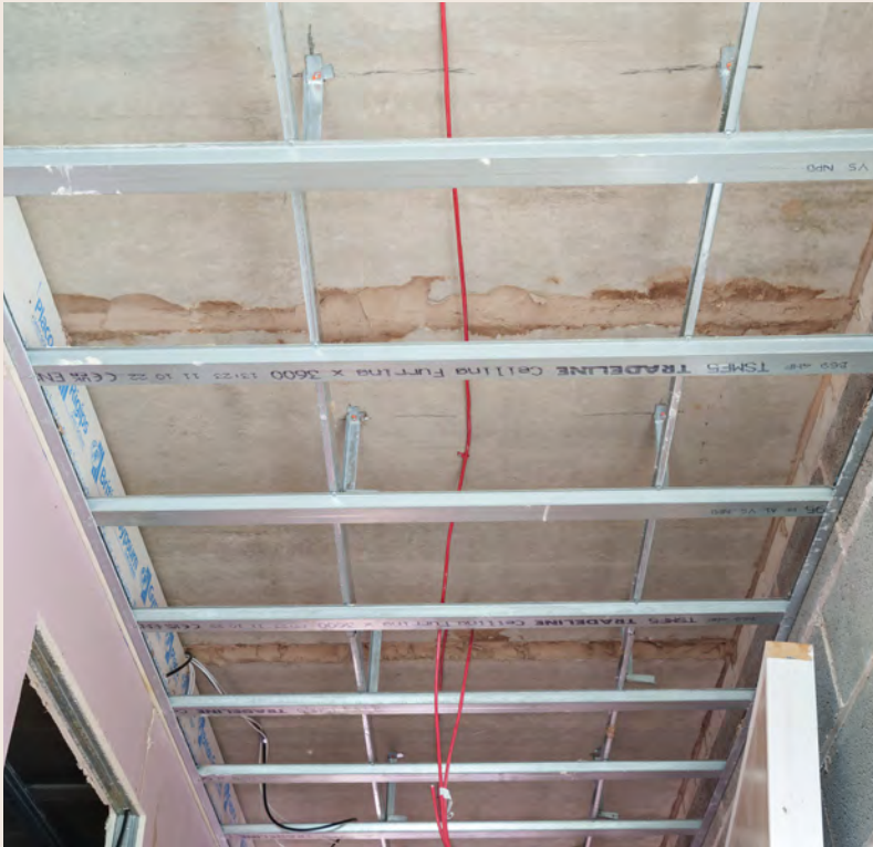
Ceiling Structure and Electricals