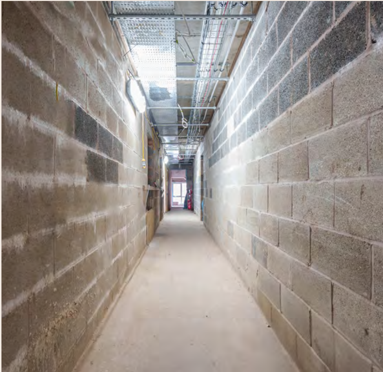
Internal Brickwork Structure