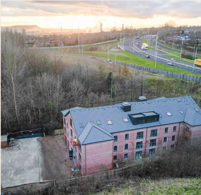
Hallwood Park Aerial View, Tawny Court