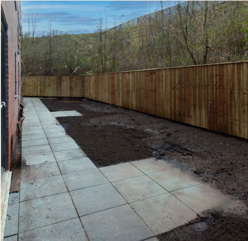
Rear Garden, Paving and Soil Laid