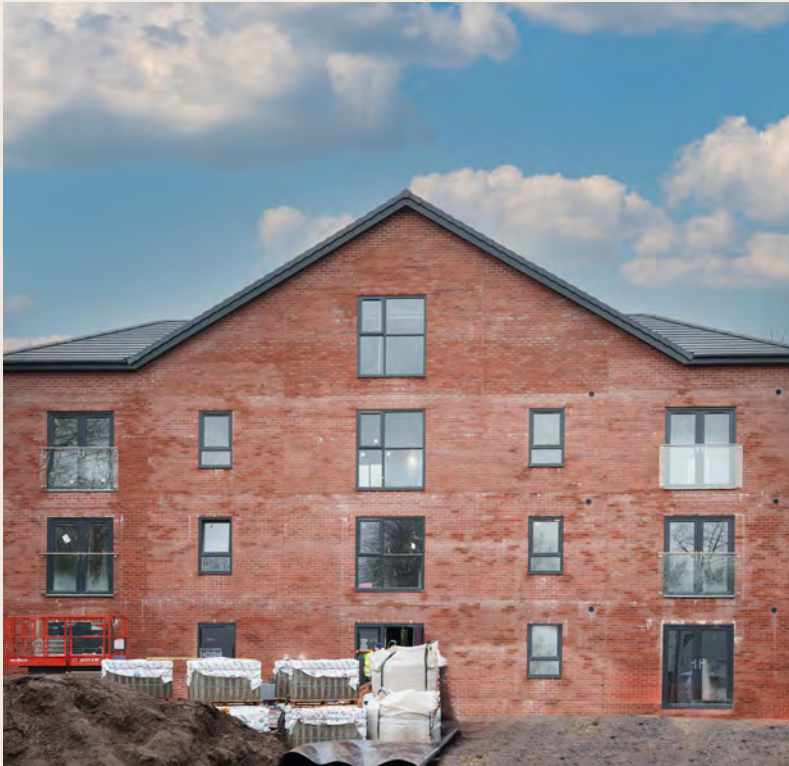
Front View of Hallwood Park, Eagles Way