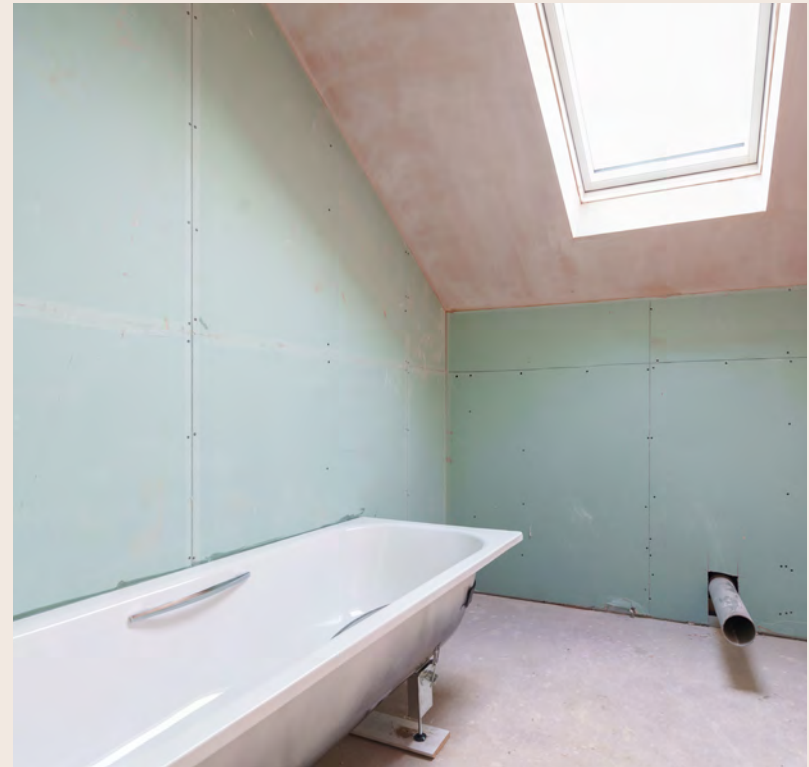
Plastering Commencement in Bathrooms on Upper Floors