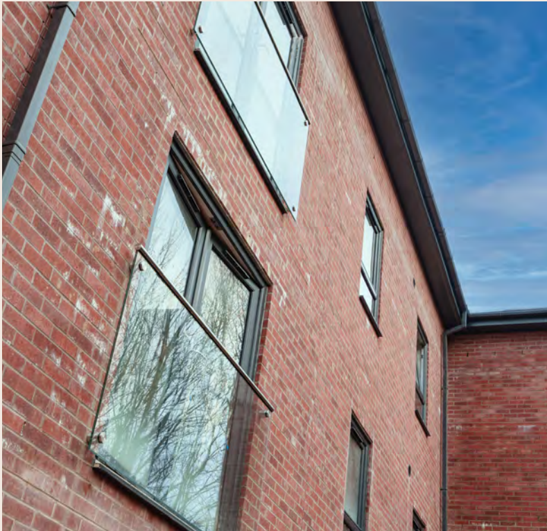
Juliet Balconies Fitting