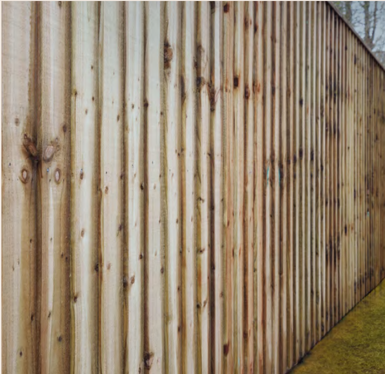
Bedroom Internal Fit-Out