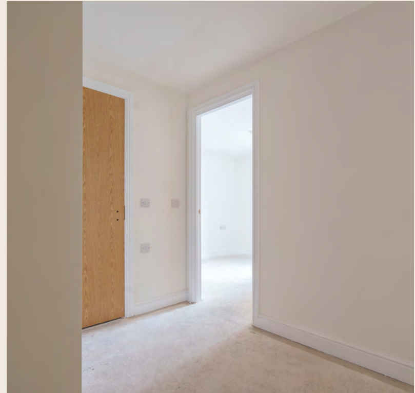
Apartment Hallway Progression