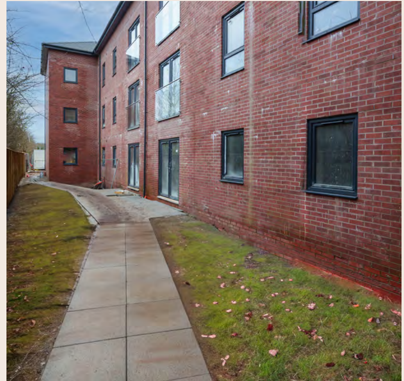
Hallwood Park, Right Side, Garden Progress