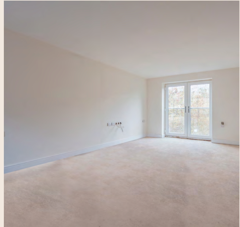
First Coat Underway in Kitchen/Living Areas of Lower Floors