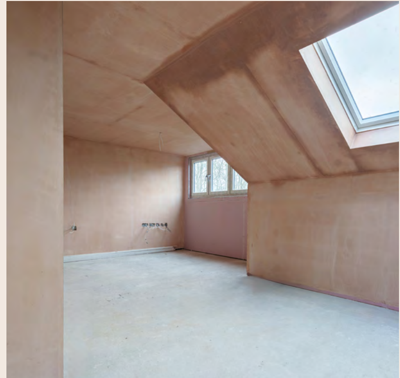
Plastering Commencement in Kitchen/Living Areas on Upper Floors