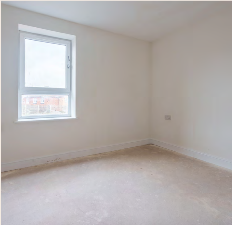
Bedroom Coat on Lower Floors