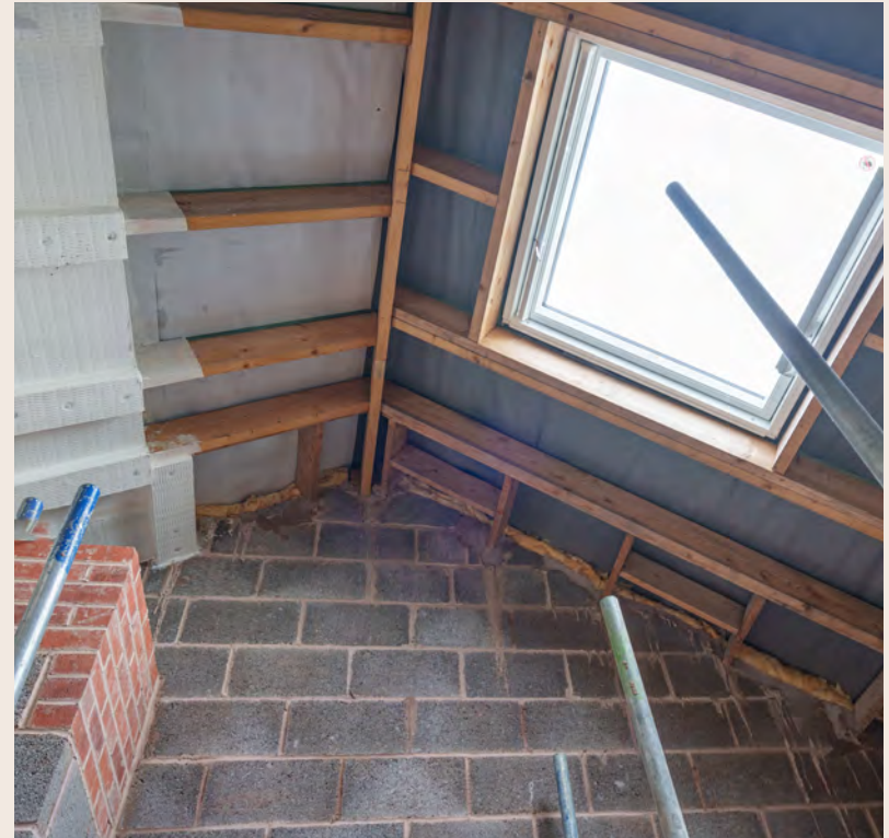
Skylight Windows Installed