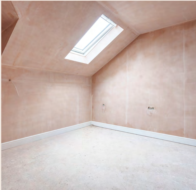
Plastering Commencement in Bedrooms on Upper Floors