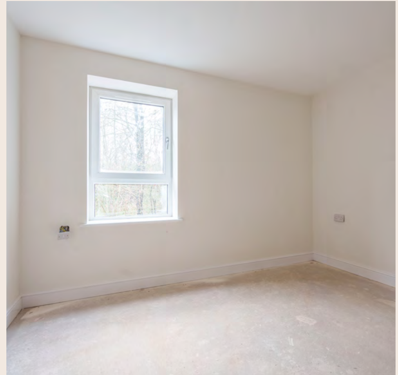
Bedroom Coat on Lower Floors