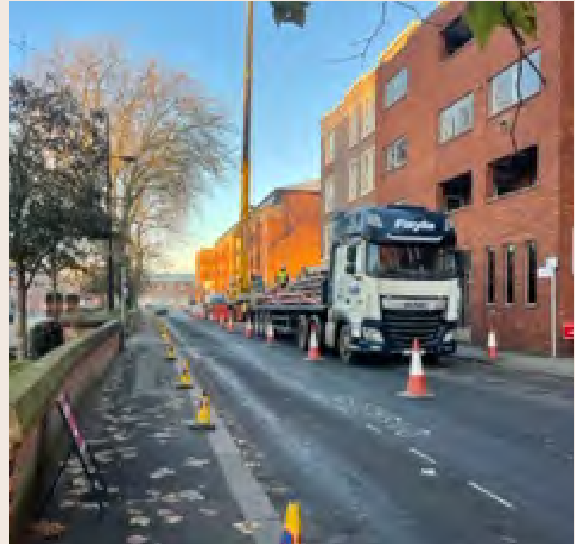
The Vicarage, Palmyra Square North View