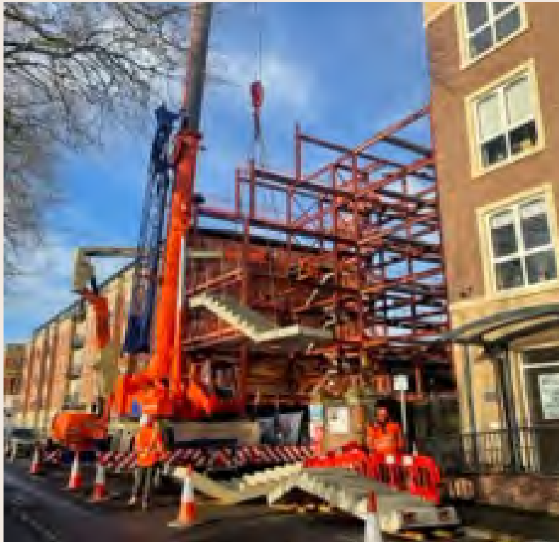
The Vicarage, Palmyra Square North View