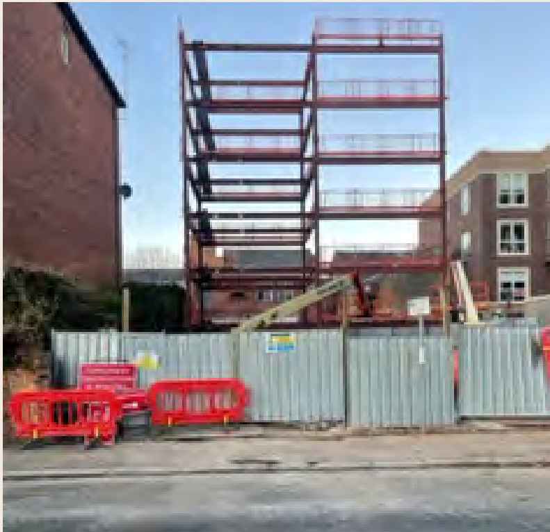
The Vicarage, Palmyra Square North View