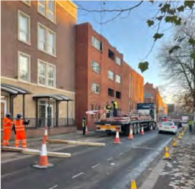
The Vicarage, Palmyra Square North View