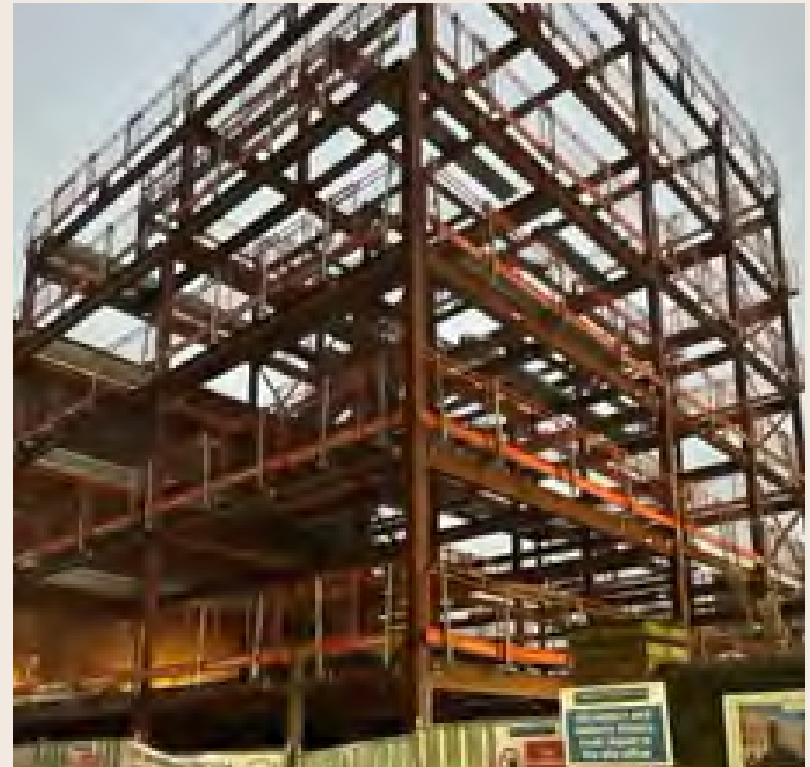
The Vicarage, Palmyra Square North View