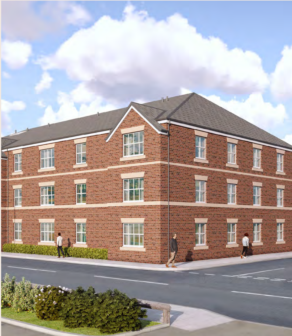
Marsh House, Manchester Road View