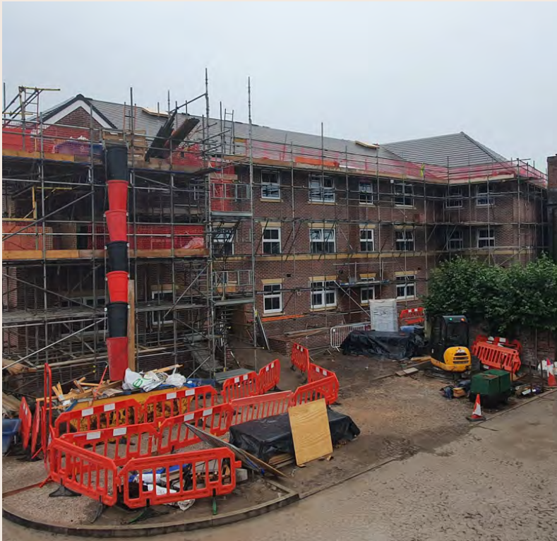
Marsh House, Rear View