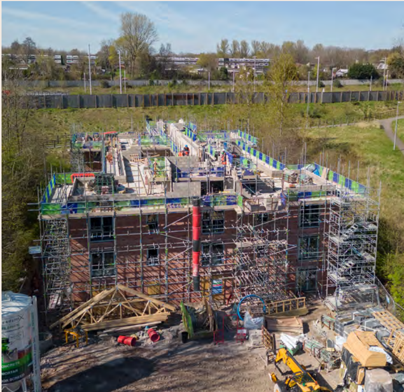
Front View of Hallwood Park, Eagles Way