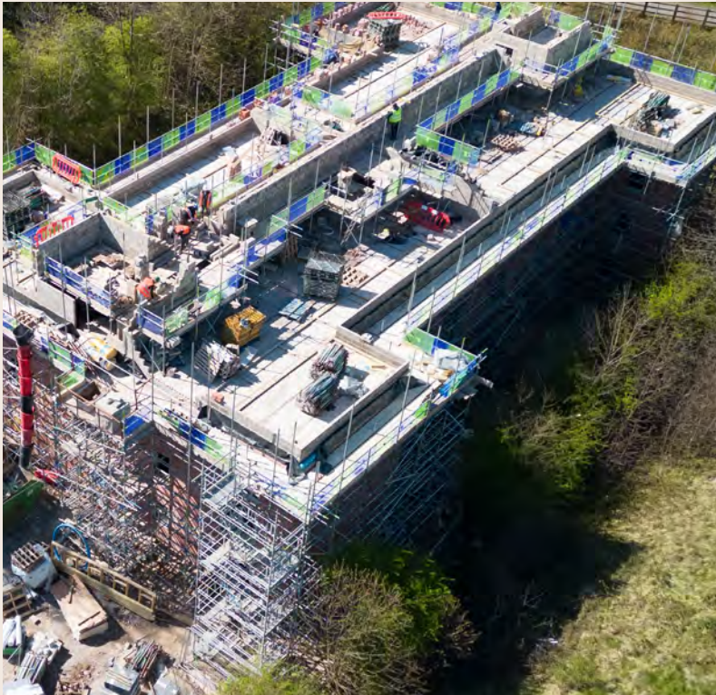
Front View of Hallwood Park, Eagles Way