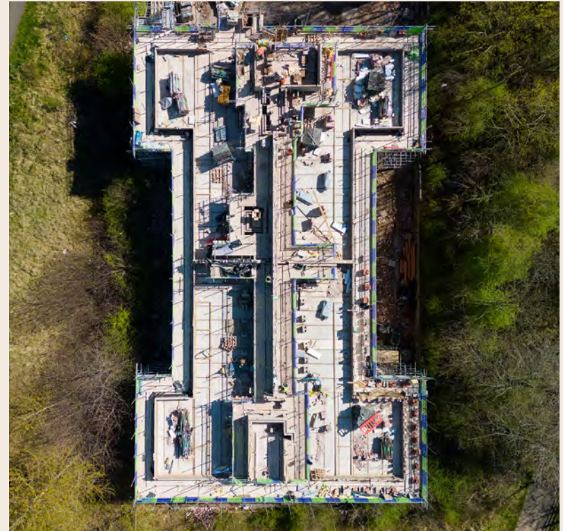
Hallwood Park, Aerial View