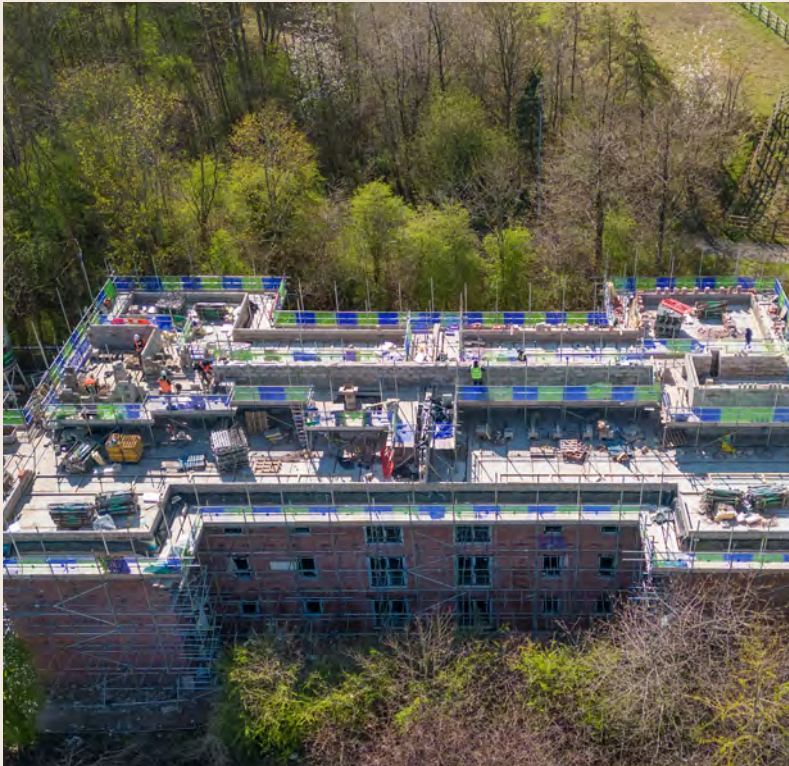
Hallwood Park, Tawny Court View