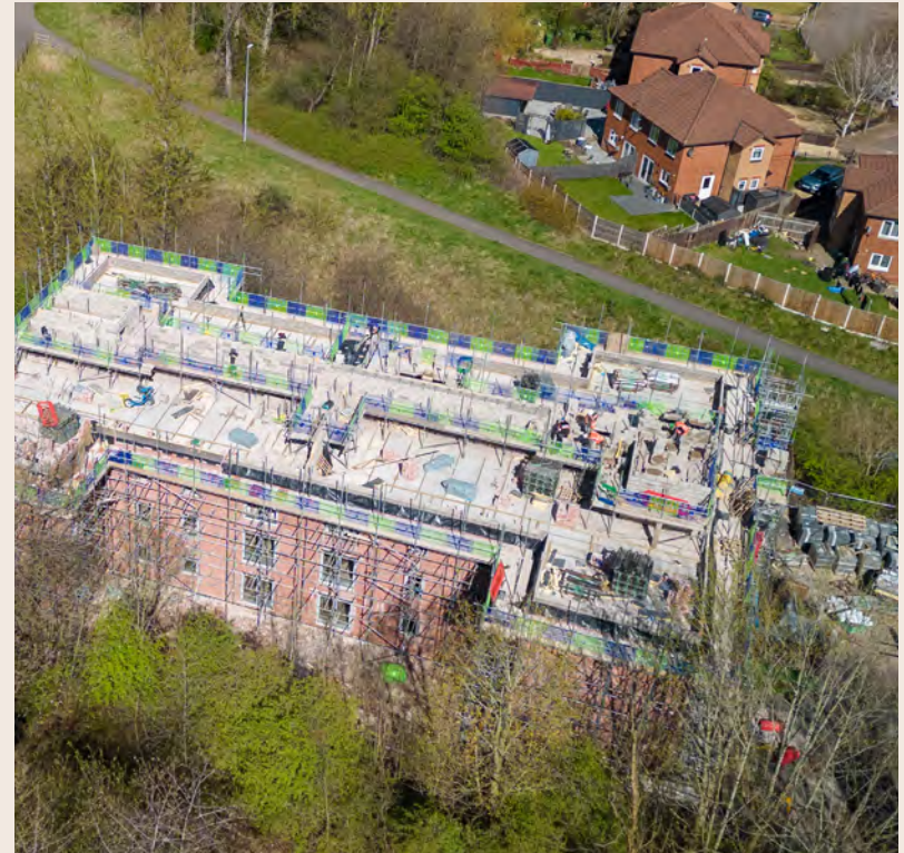
Hallwood Park, Gaunts Way View