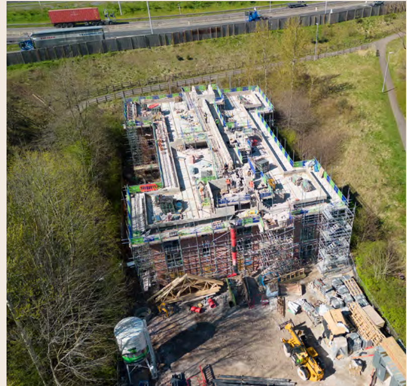
Front View of Hallwood Park, Eagles Way