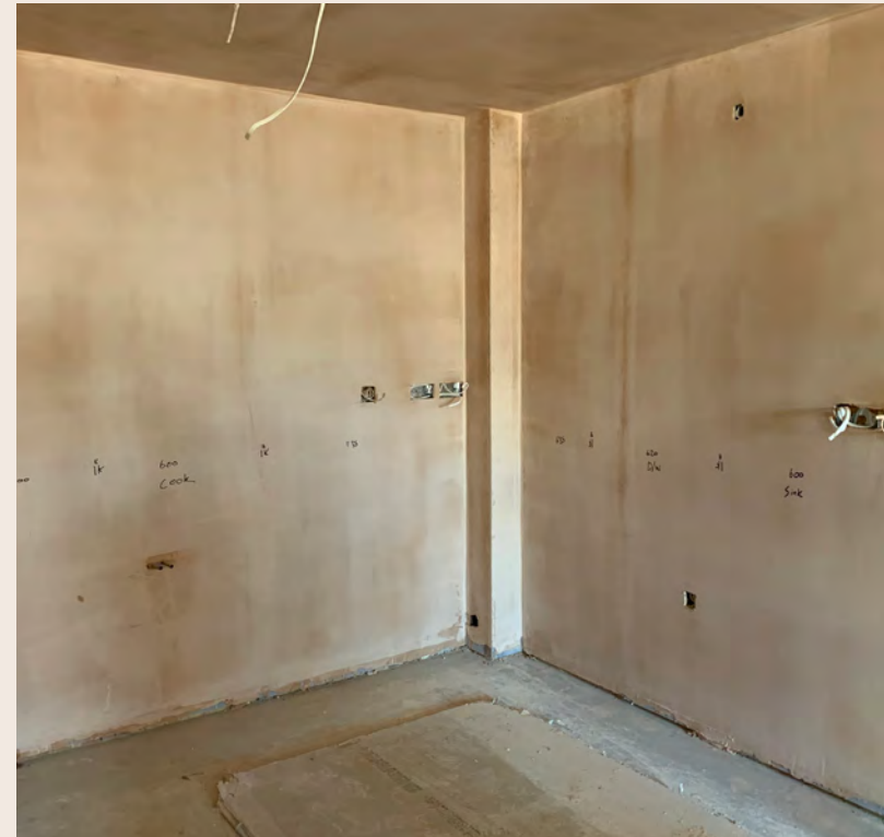
Internal Room Progression