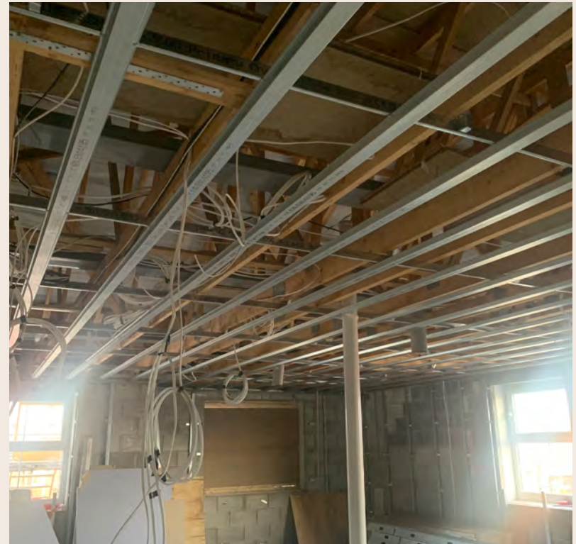
Internal Room Progression