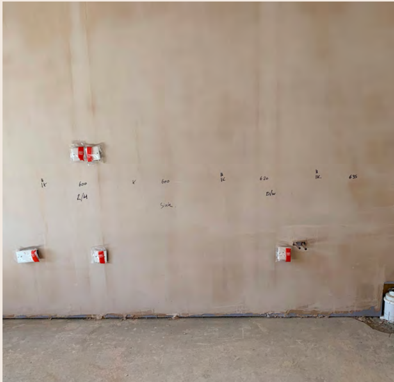
Internal Room Progression