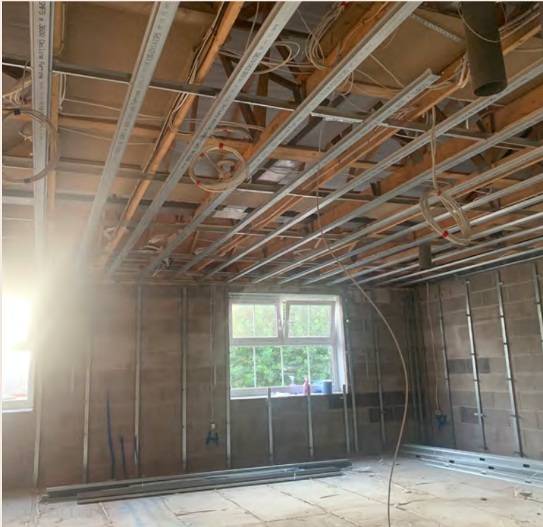
Internal Room Progression