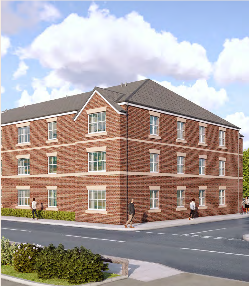
Marsh House, Manchester Road View