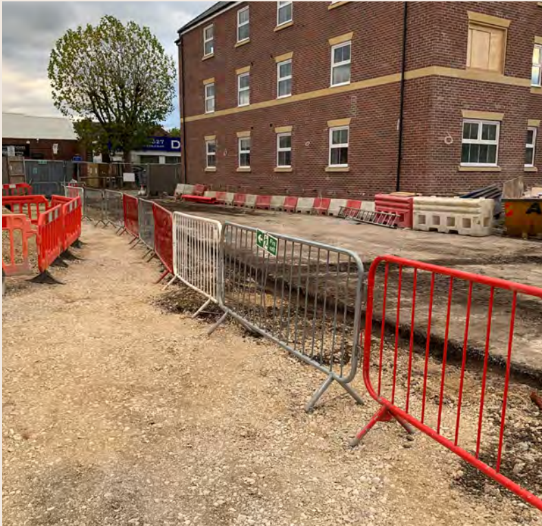
Marsh House, Rear View