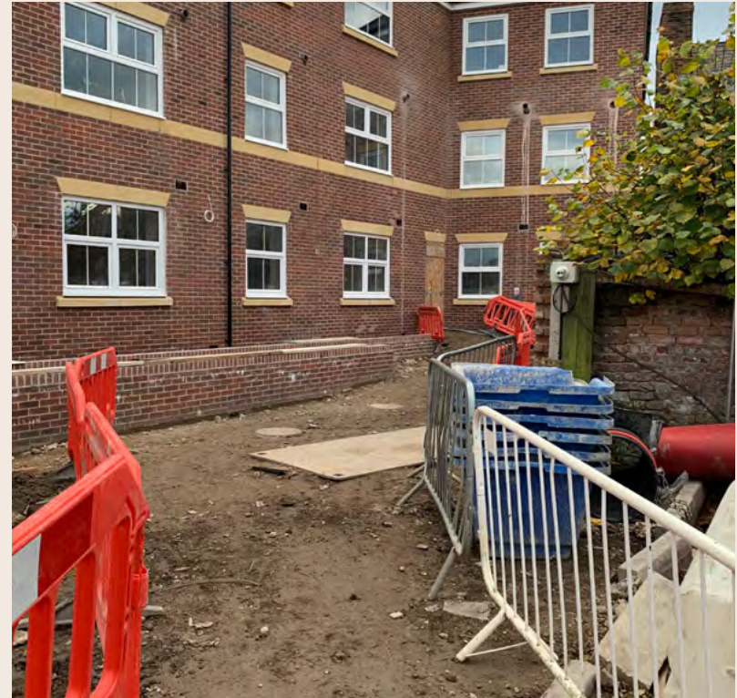
Marsh House, Rear View