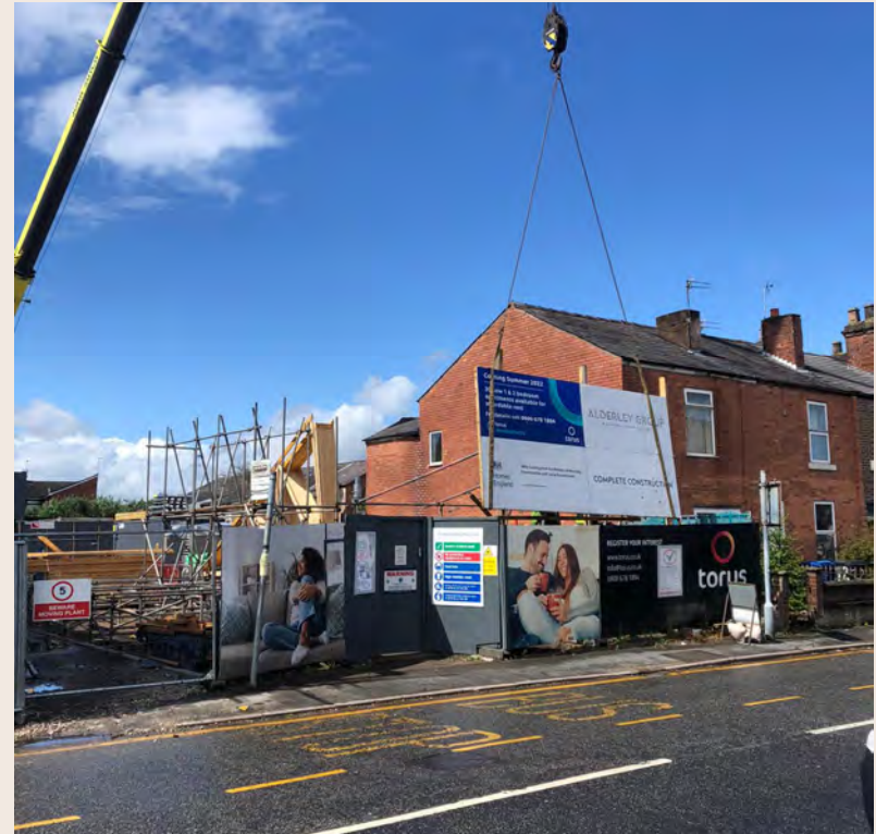
Marsh House, Manchester Road View