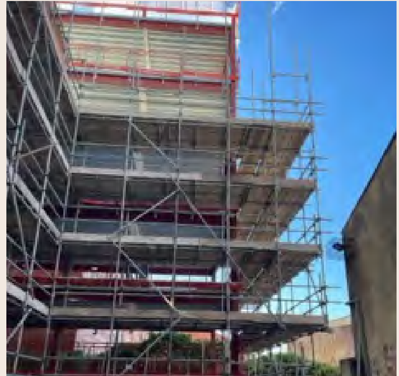
The Vicarage, Palmyra Square North View