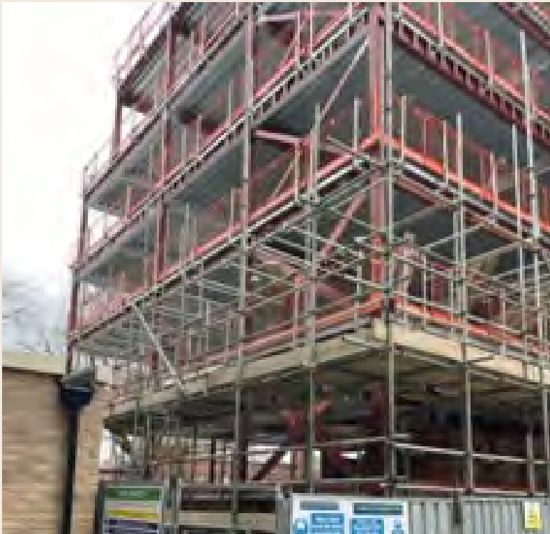
The Vicarage, Palmyra Square North View