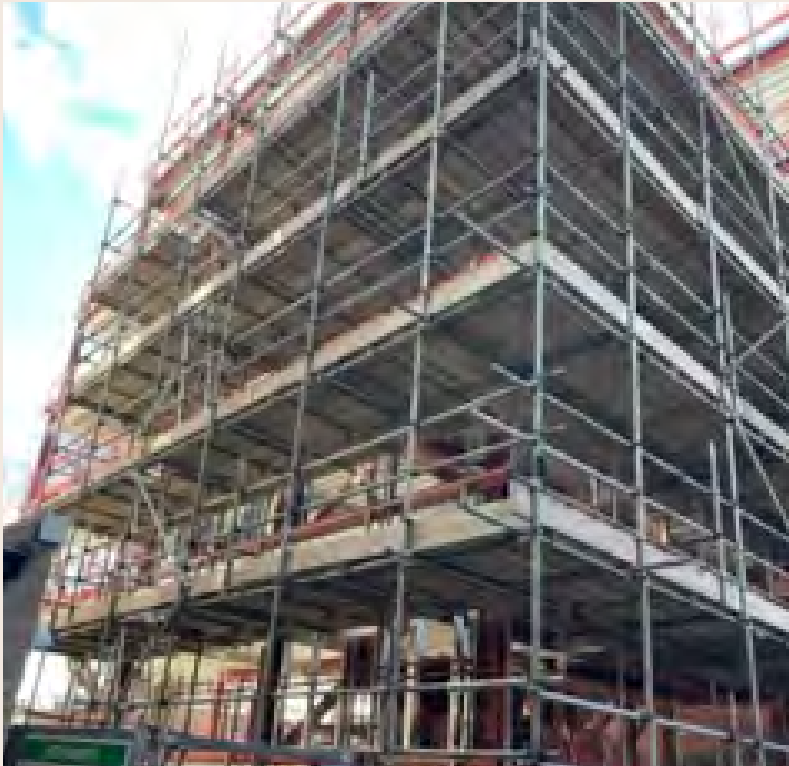
The Vicarage, Palmyra Square North View