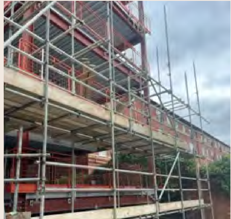
The Vicarage, Sankey Street View