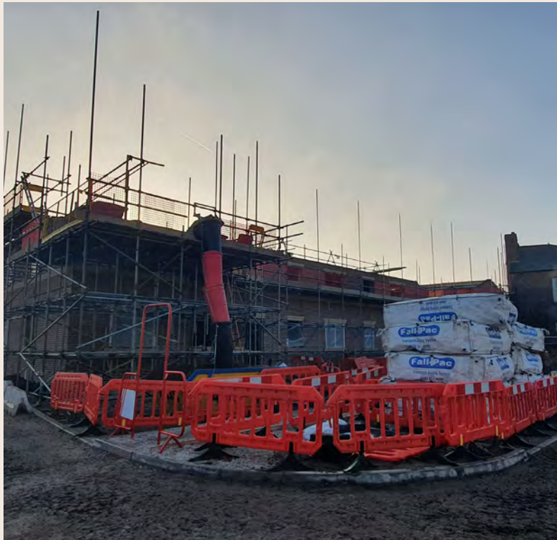
Marsh House, Manchester Road View