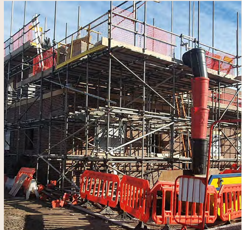
Marsh House, Manchester Road View