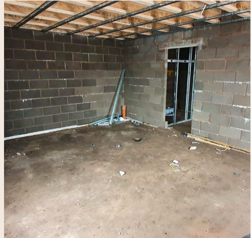
Internal Room Progression