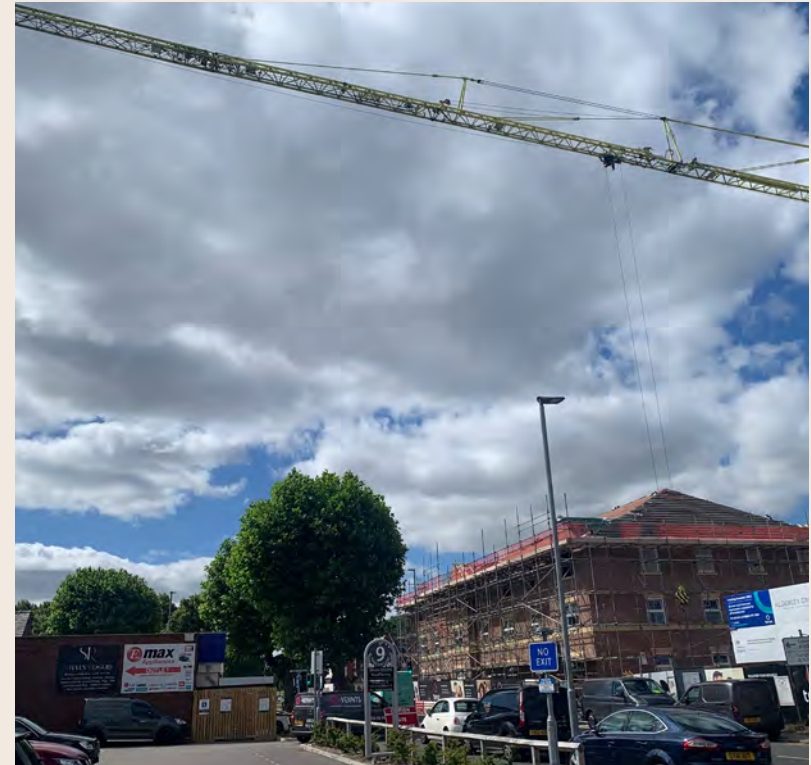
Marsh House, Manchester Road View