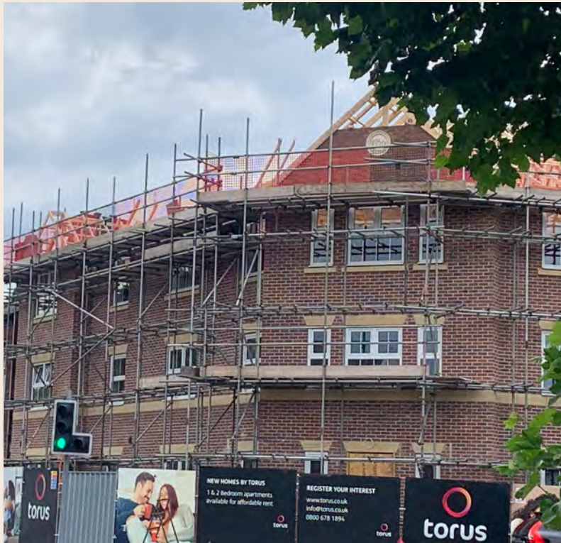
Marsh House, Manchester Road View