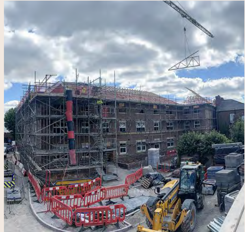
Marsh House, Rear View