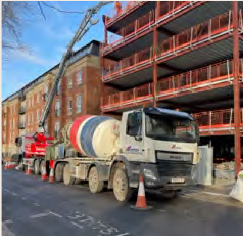
The Vicarage, Palmyra Square North View