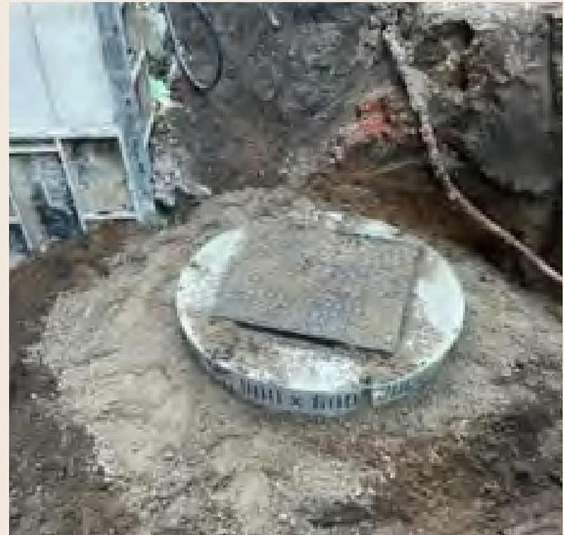
Drainage Manhole Ring