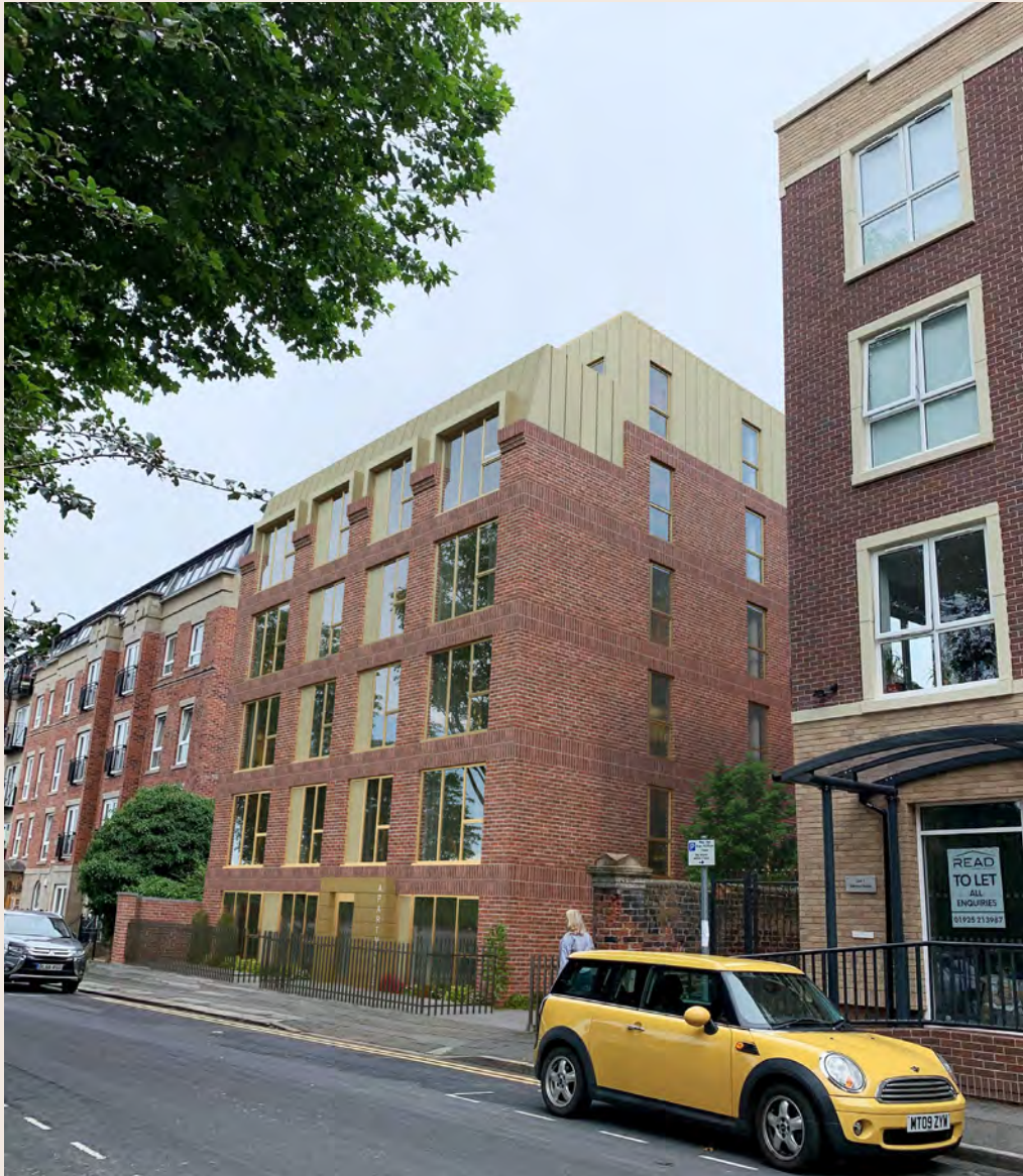
View of The Vicarage from Palmyra Square North