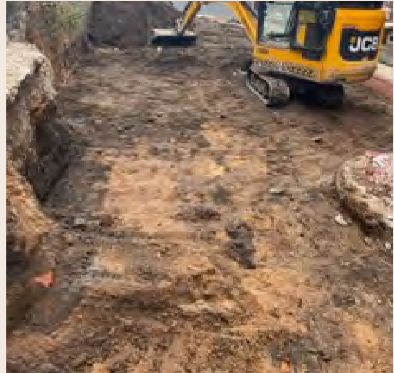
Reduce Dig Level