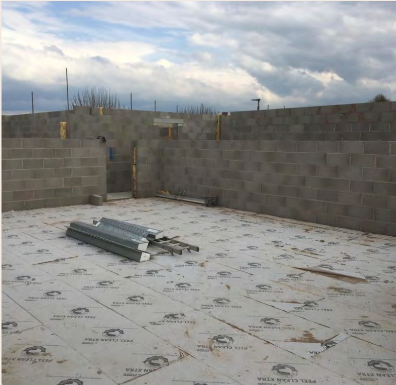
Internal Room Progression