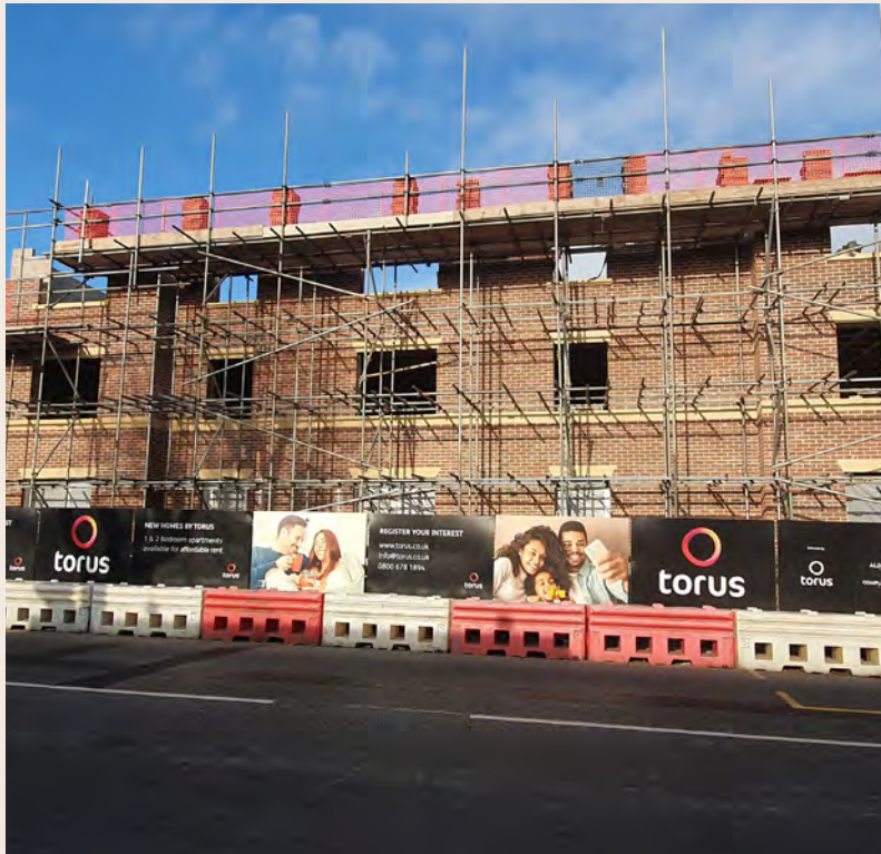
Marsh House, Manchester Road View