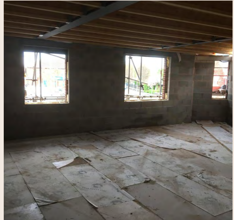
Internal Room Progression